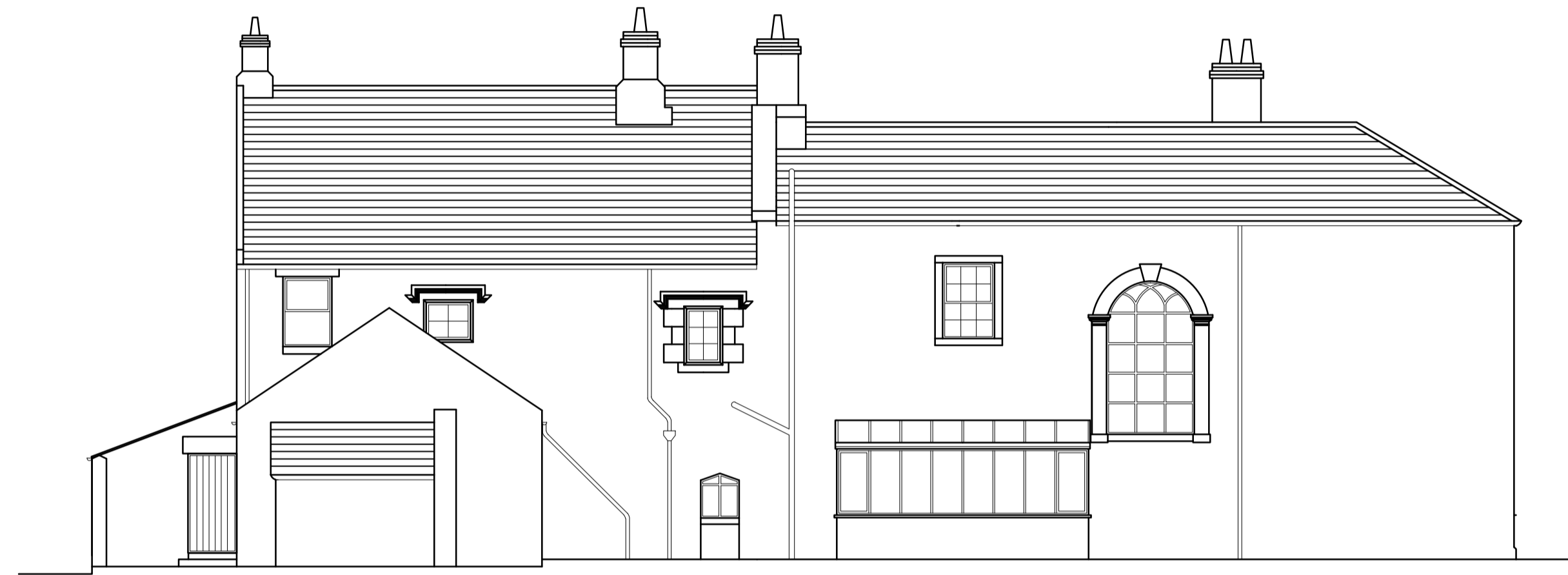
Rear Elevation as Existing at 1:100