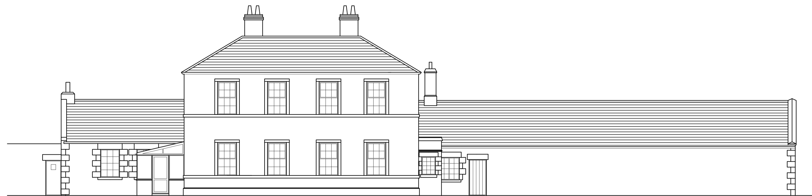
Side Elevation as Existing at 1:100