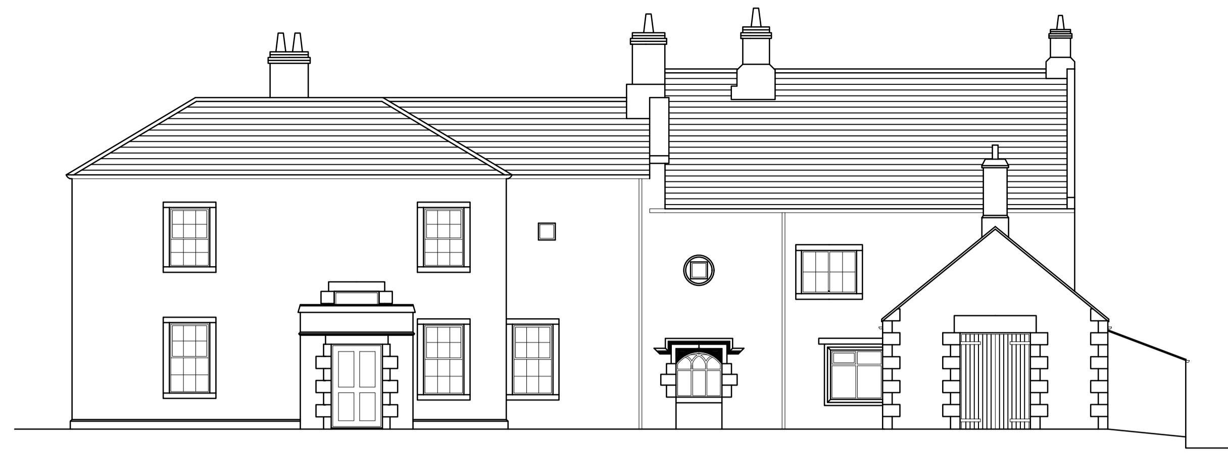
Front Elevation as Existing at 1:100

All dimensions to be checked on site. Do not Scale from the drawing. Any discrepancies to be reported to the Project Surveyor before the commencement of any works.