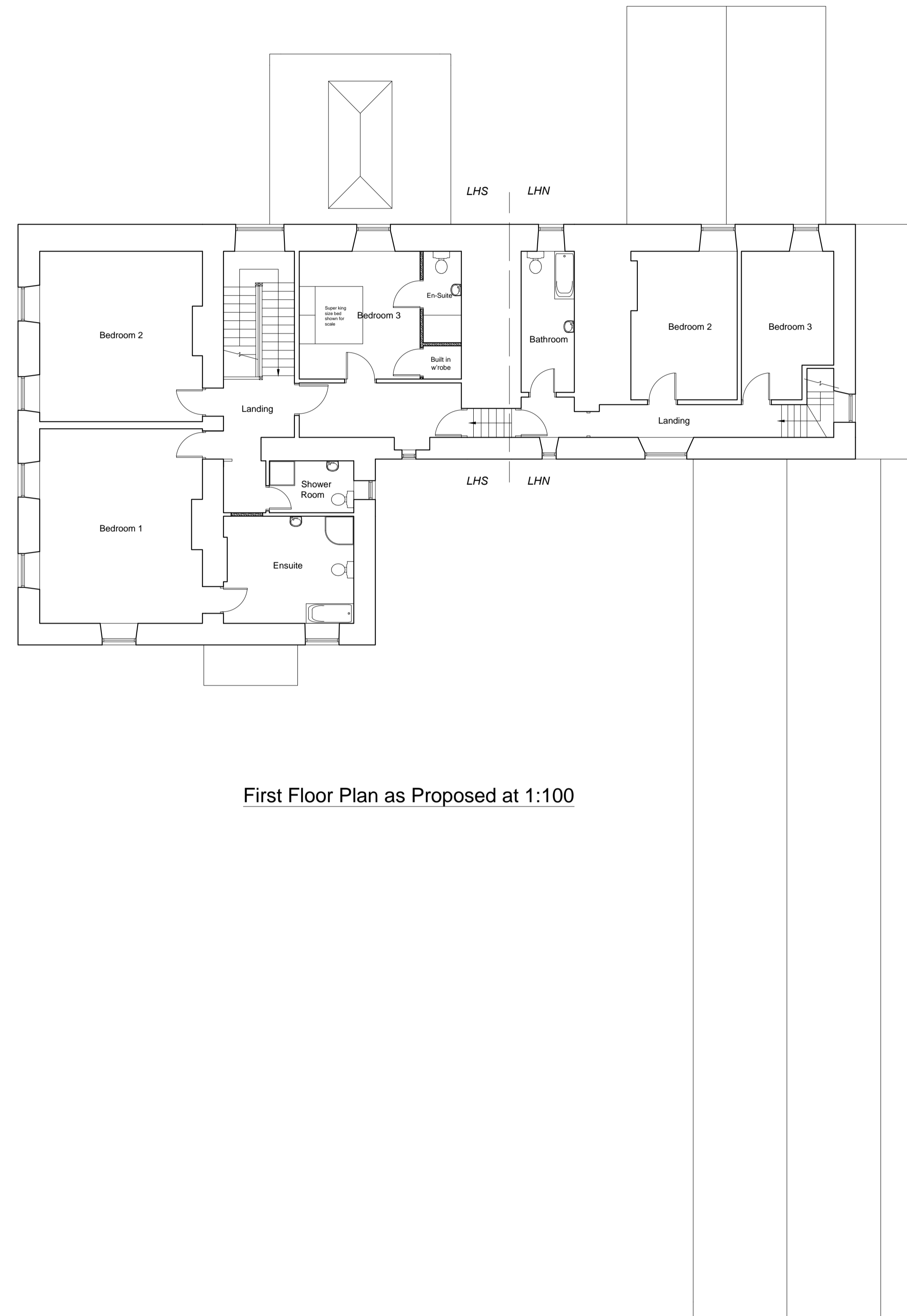
First Floor Plan as Proposed at 1:100