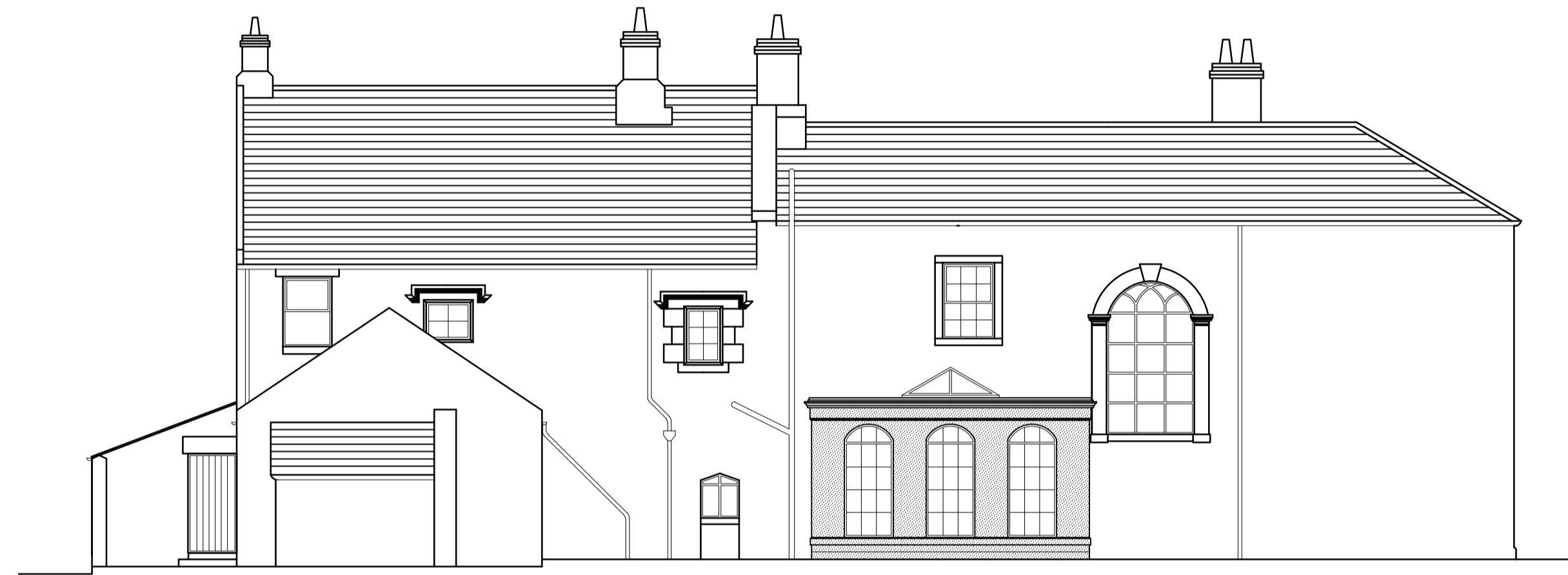
Rear Elevation as Proposed at 1:100