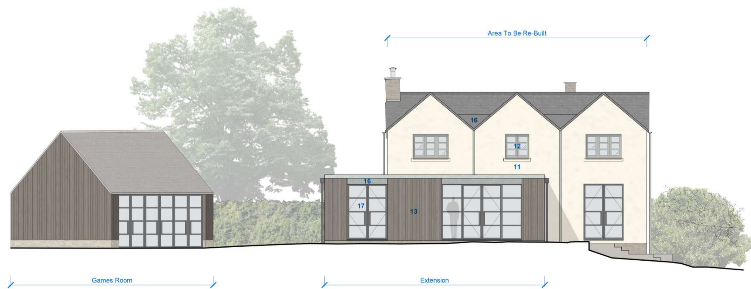
03 PROPOSED NORTH ELEVATION 1:100