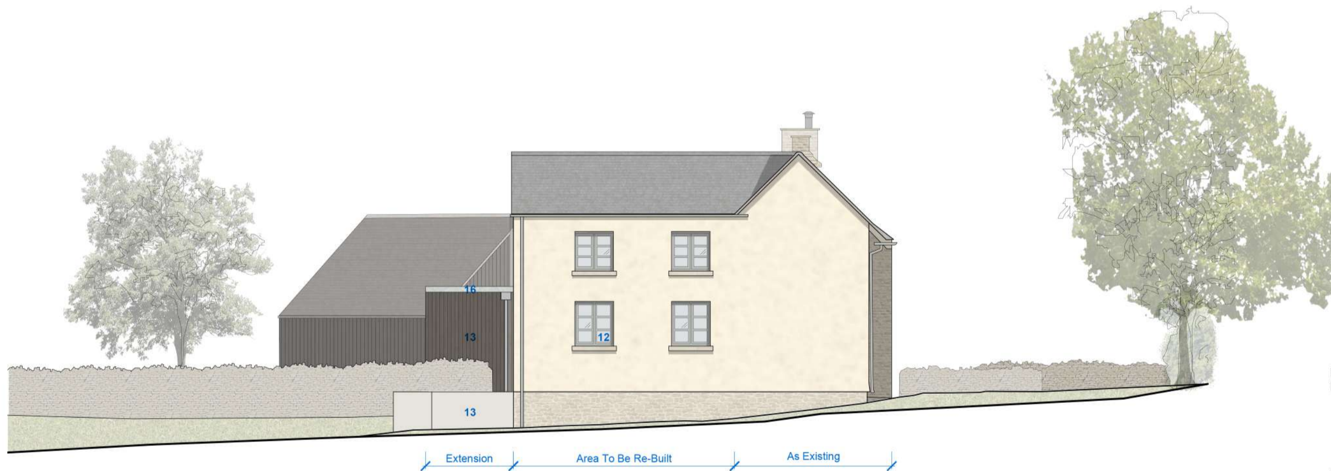
04 PROPOSED WEST ELEVATION 1:100

DRAWING REPRODUCED FROM ORIGINAL SURVEY DRAWINGS BY: MONUMENT GEOMATICS LIMITED TEL 01594 546 324