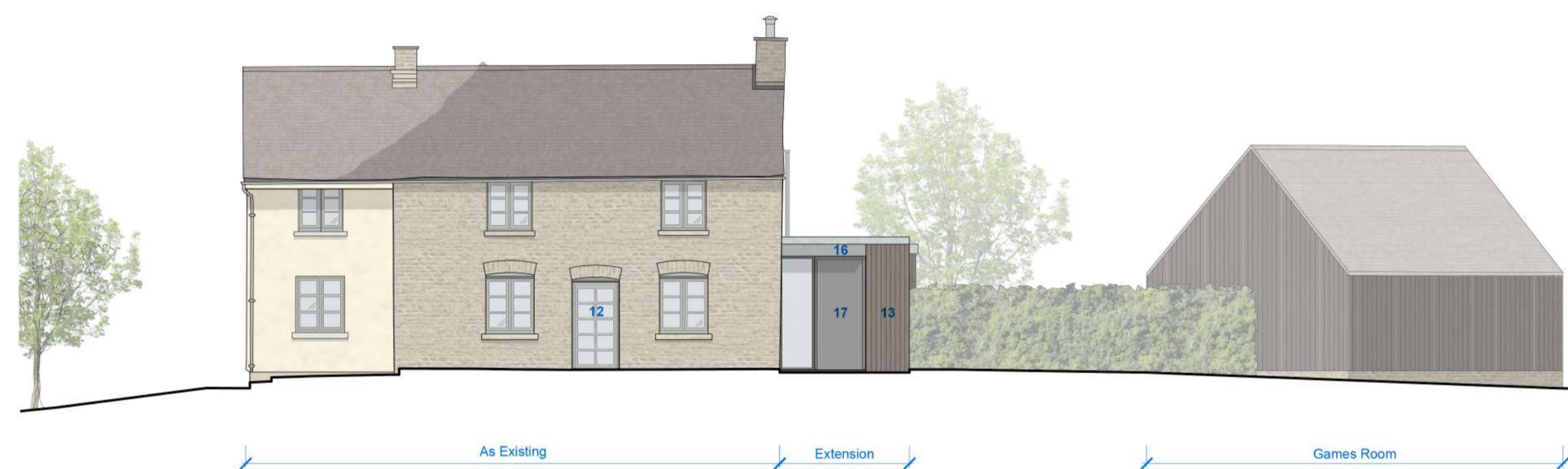
01 PROPOSED SOUTH ELEVATION 1:100