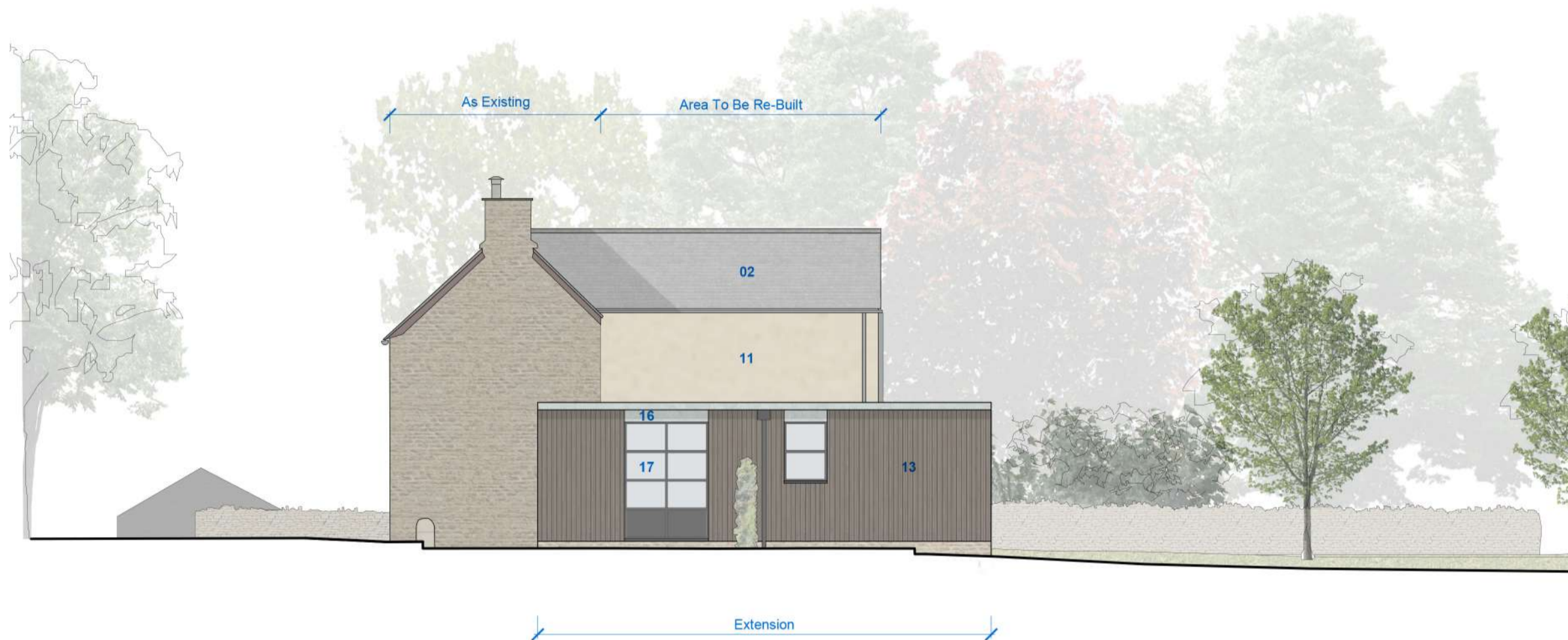
02 PROPOSED EAST ELEVATION 1:100