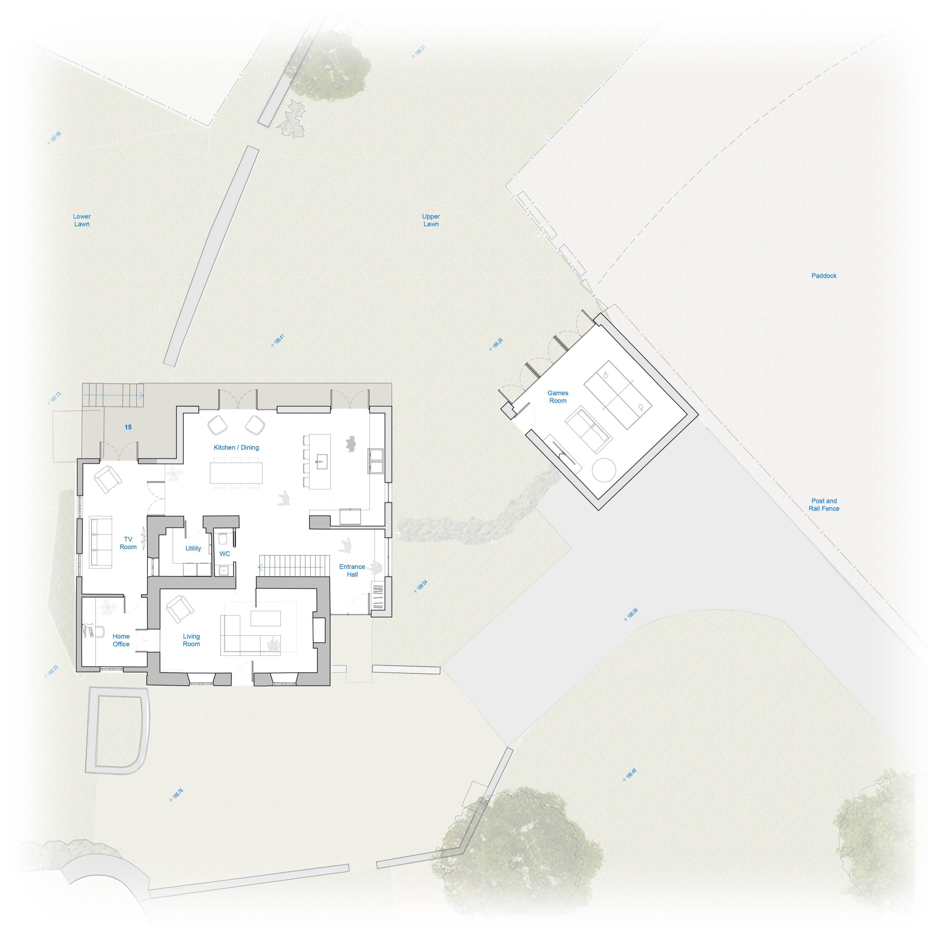
01 PROPOSED GROUND FLOOR PLAN 1:100