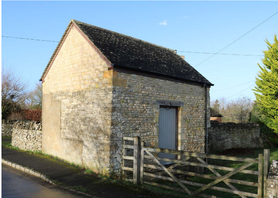
South and East Elevations