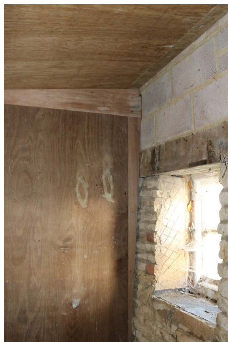
Southern Section Door & Window Detail