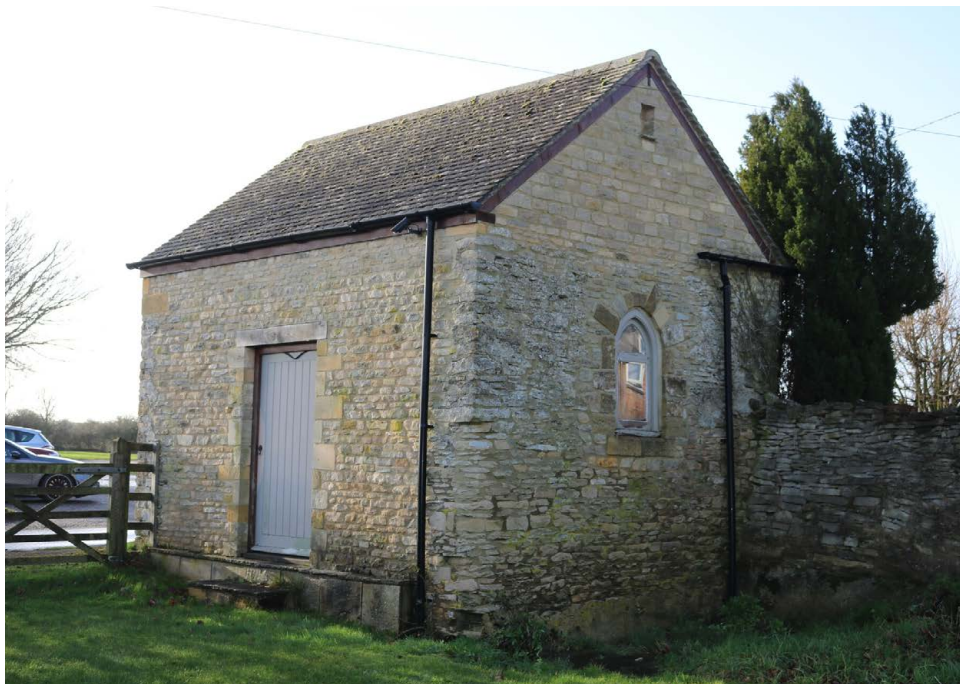
North and East Elevations