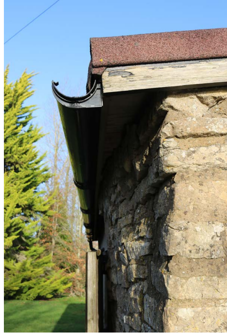
Verge & Eave Details