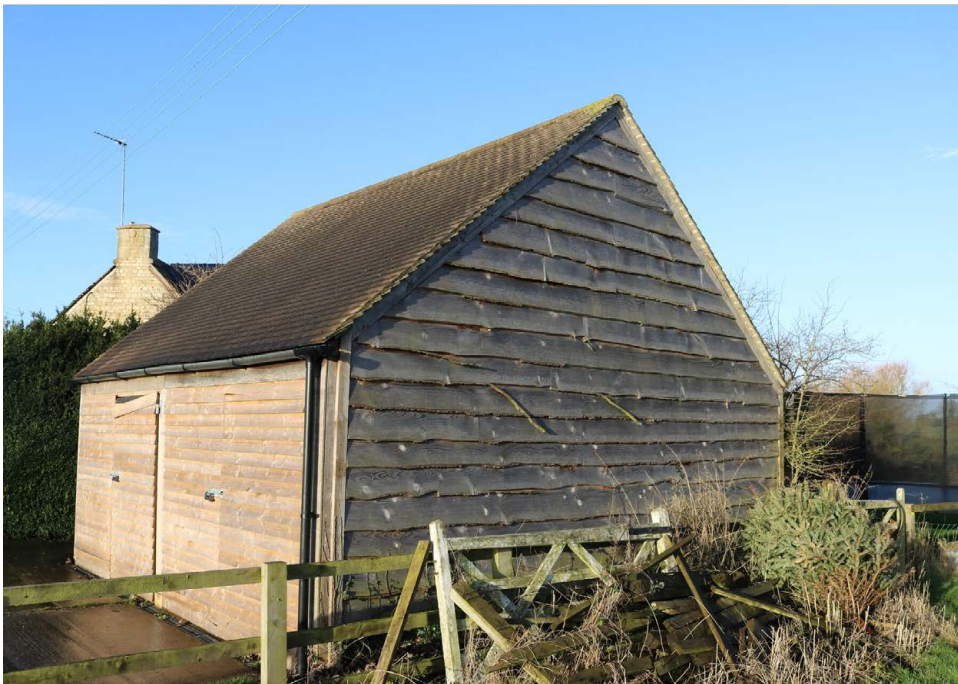
Side (North East) Elevation