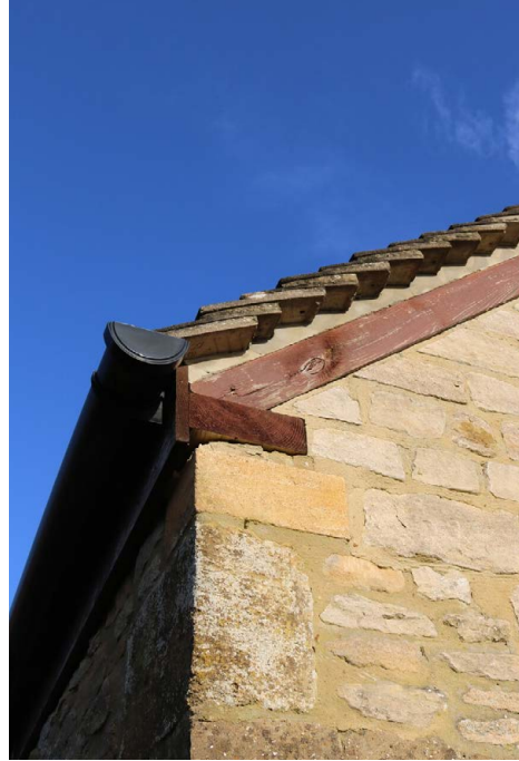
Verge, Eave and Ridge Details