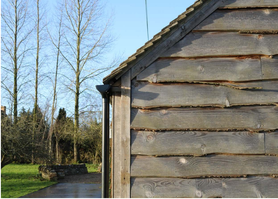
Verge and Eave Detail