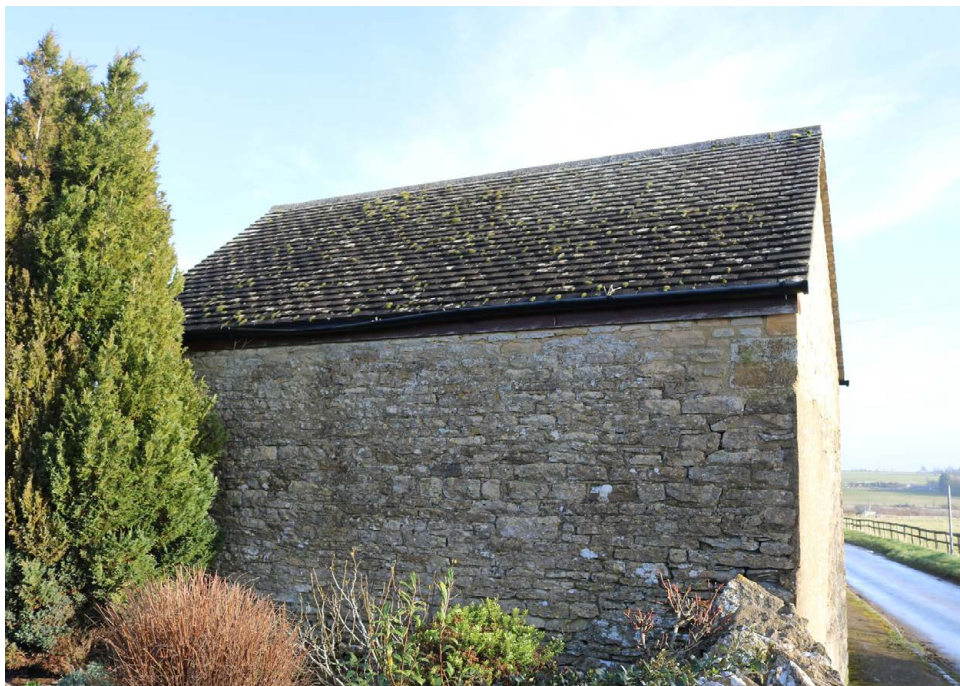
West Elevation (Neighbours Boundary)