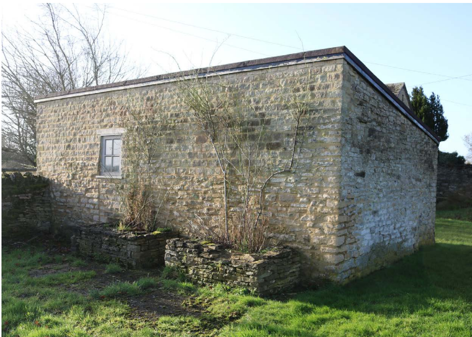
North & East Elevations