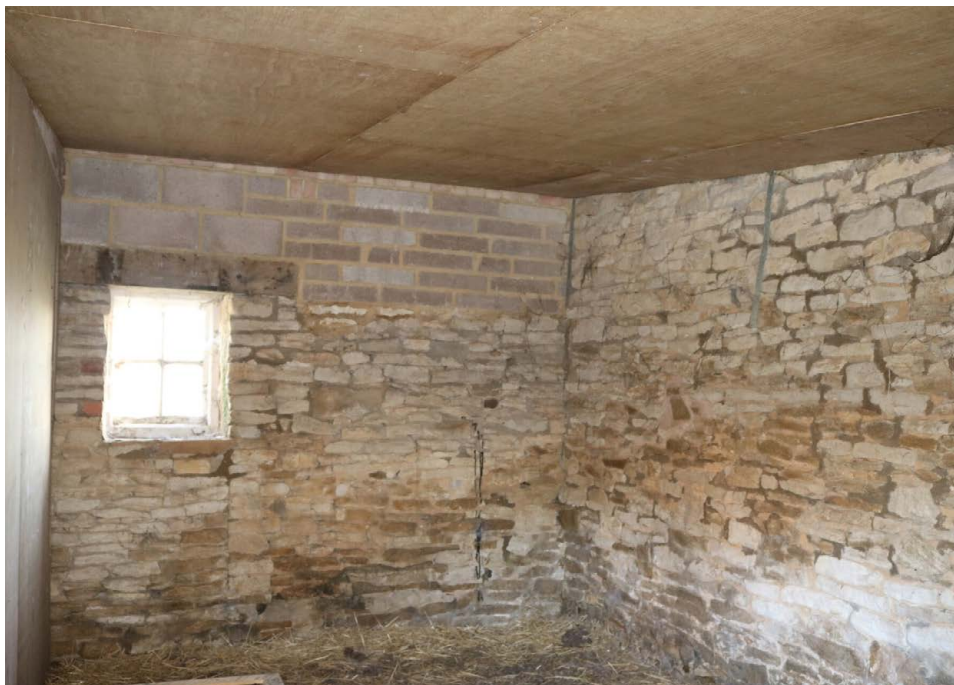
Southern Section General View