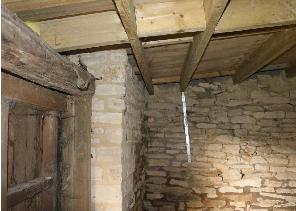
Northern Section General View