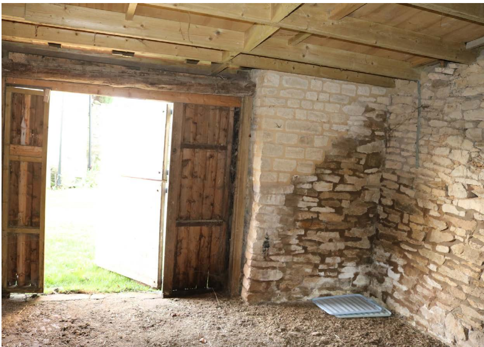
Northern Section General View