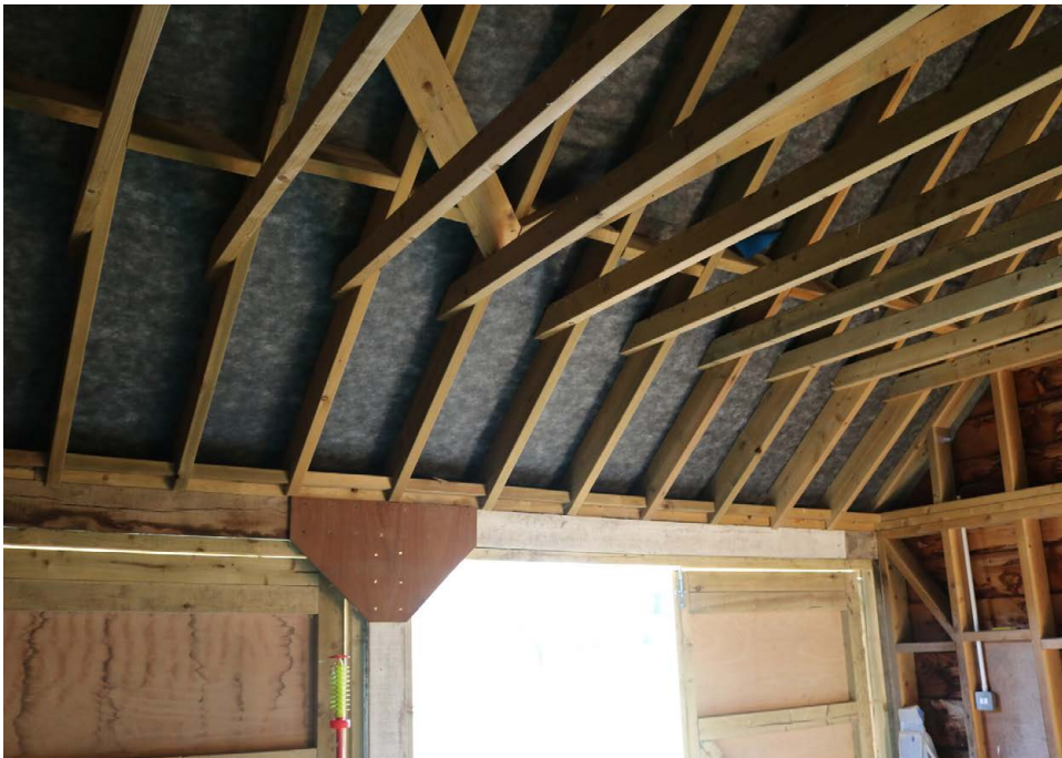
Exposed Timber Frame - Roof