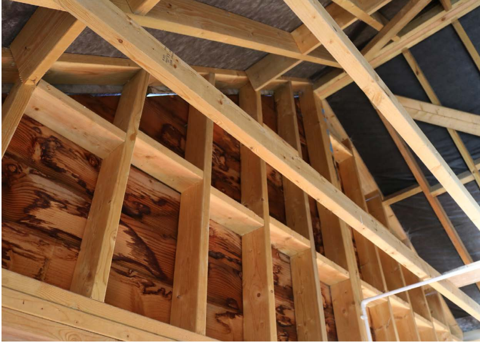
Exposed Timber Frame - Gable