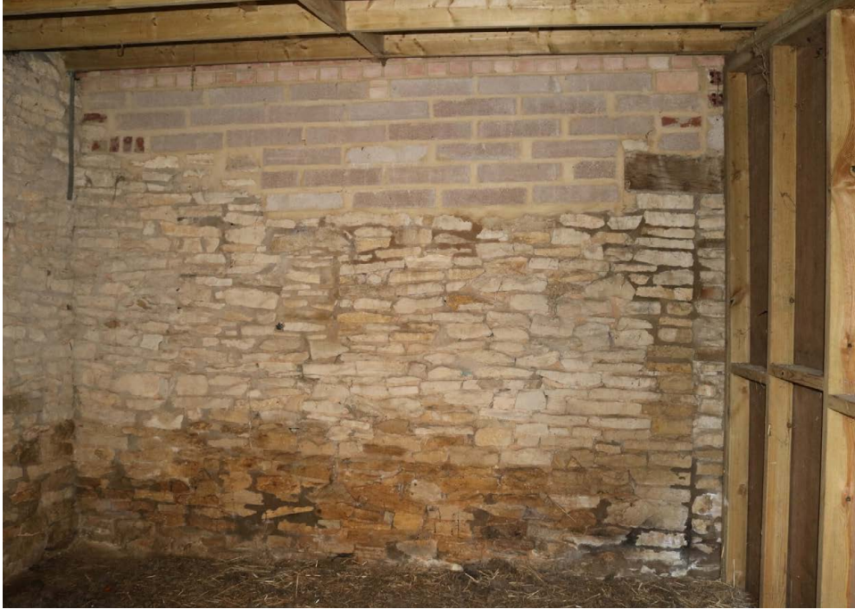
Northern Section General View