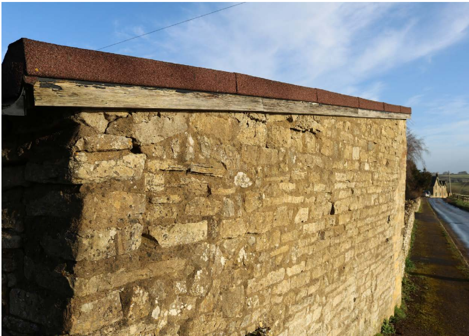
Verge (South Elevation)