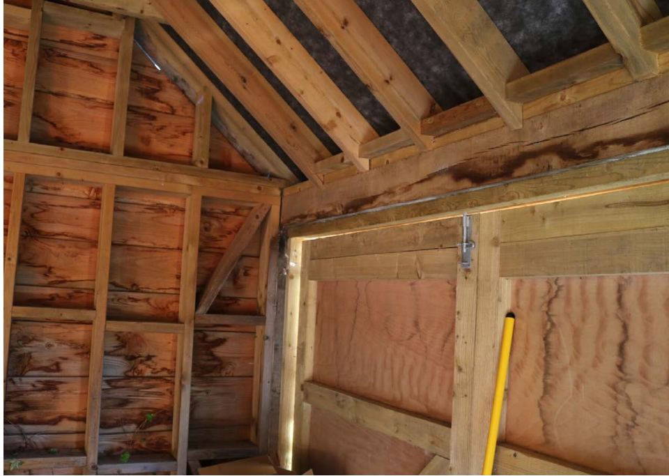
Exposed Timber Frame - Corner