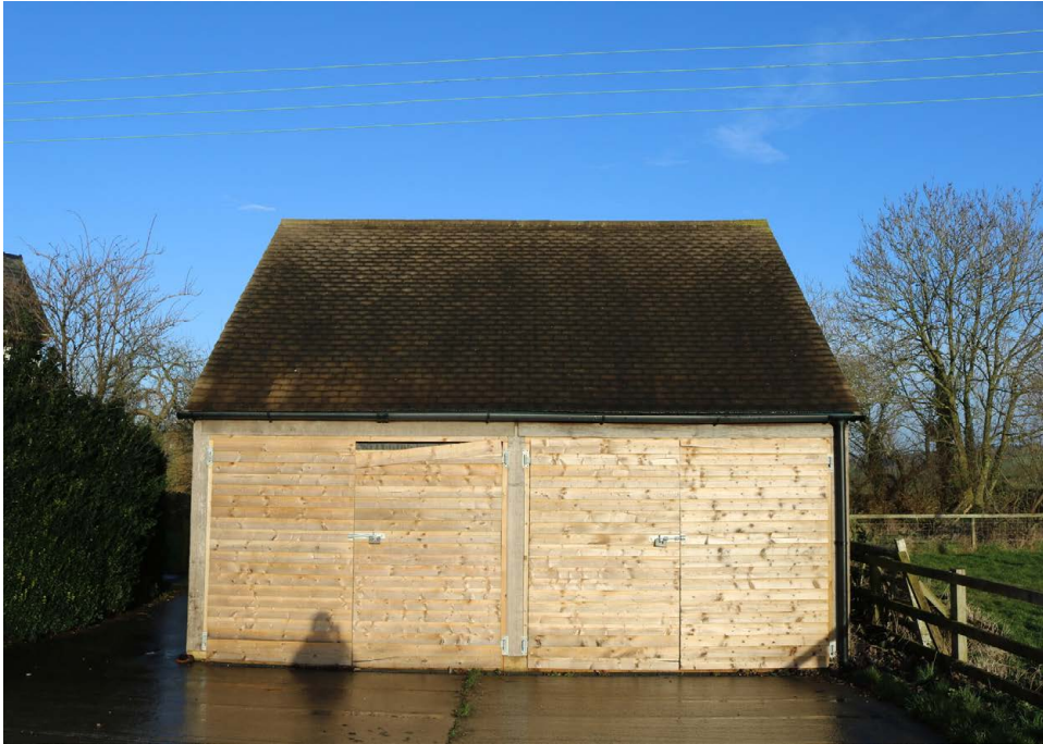
Front (South East) Elevation