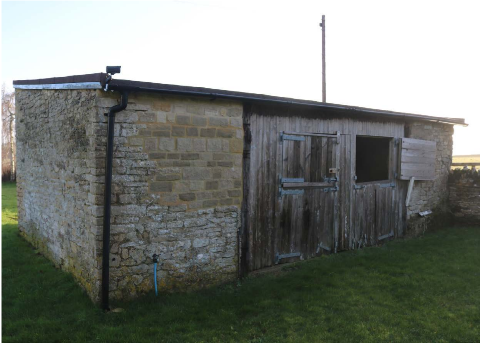
North & West Elevations