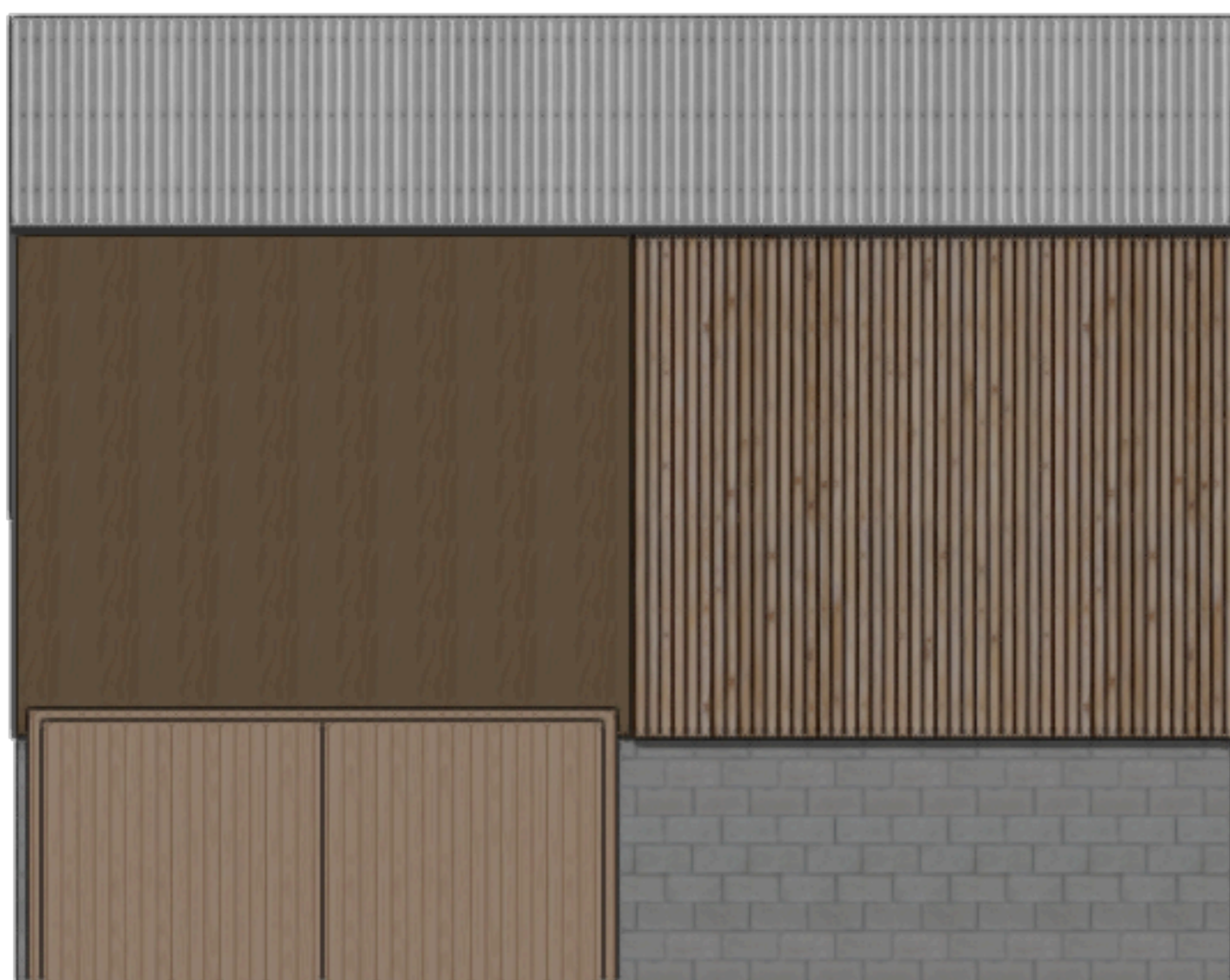
SOUTH ELEVATION 1:50