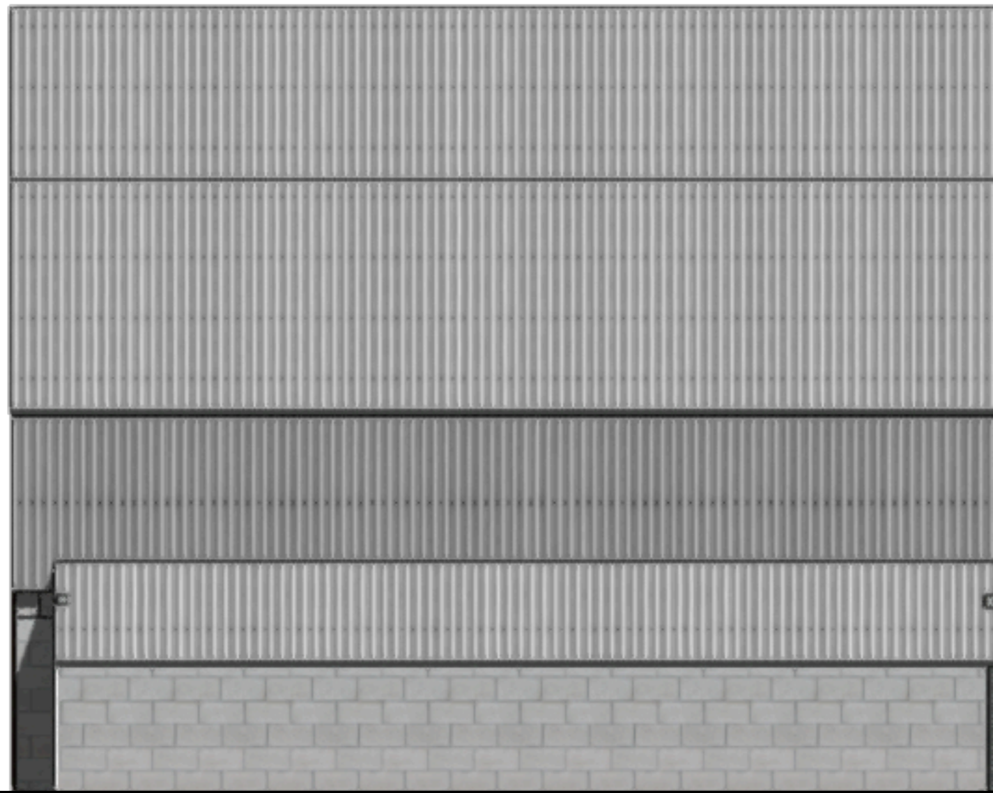
NORTH ELEVATION 1:50