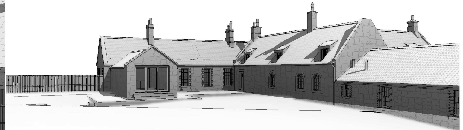
4 Proposed 3D View 4