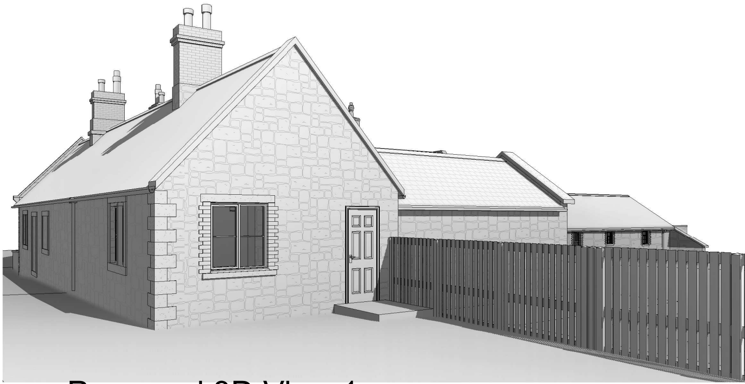
1 Proposed 3D View 1