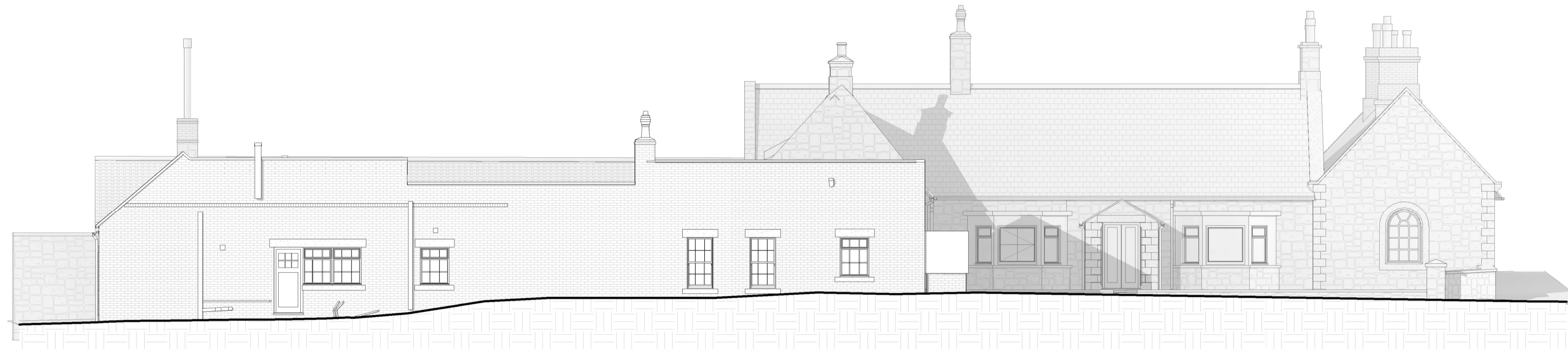
2 05.A1 South East Elevation 1 : 100