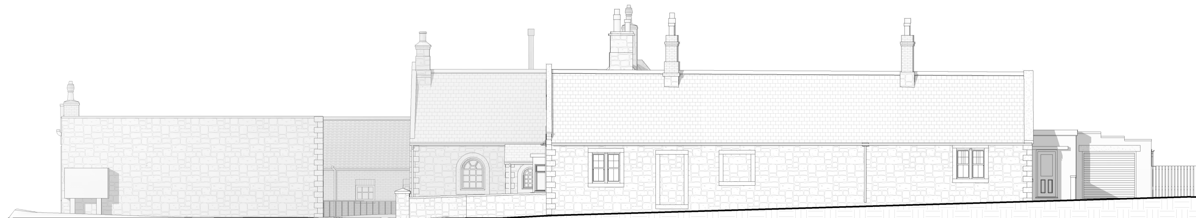
4 05.A1 South West Elevation 1 : 100