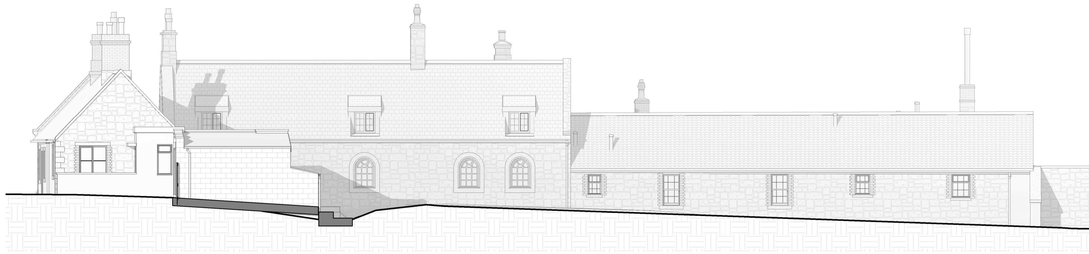
1 05.A1 North West Elevation 1 : 100

IF IN ANY DOUBT PLEASE ASK THE DESIGNER FOR CLARIFICATION DO NOT SCALE FROM DRAWINGS. ALL DIMENSIONS TO BE CHECKED ON SITE THE COPYRIGHT FOR THESE DRAWINGS REMAINS THE PROPERTY OF CHA. THEY MUST NOT BE REPRODUCED IN ANY WAY WITHOUT CHA'S PRIOR WRITTEN CONSENT