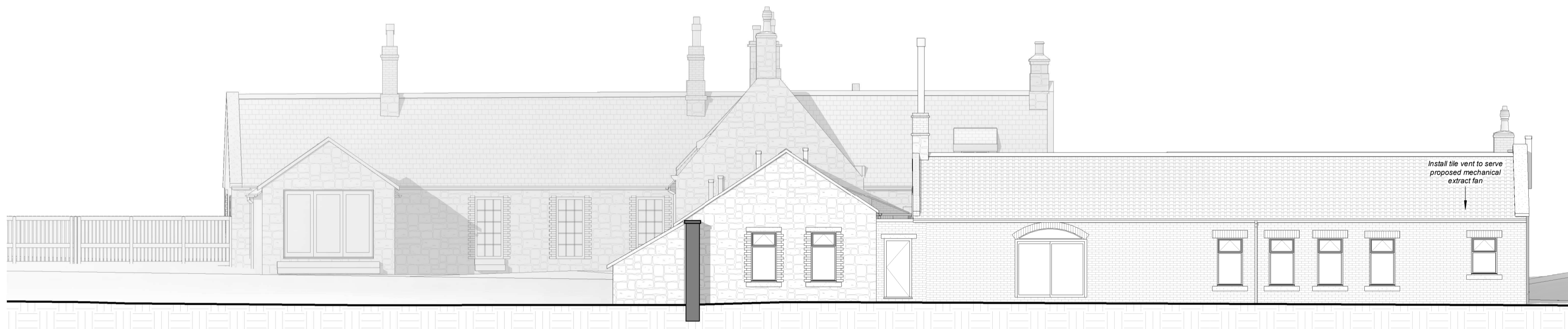
3 26.A1 Proposed North East Elevation 1 : 100