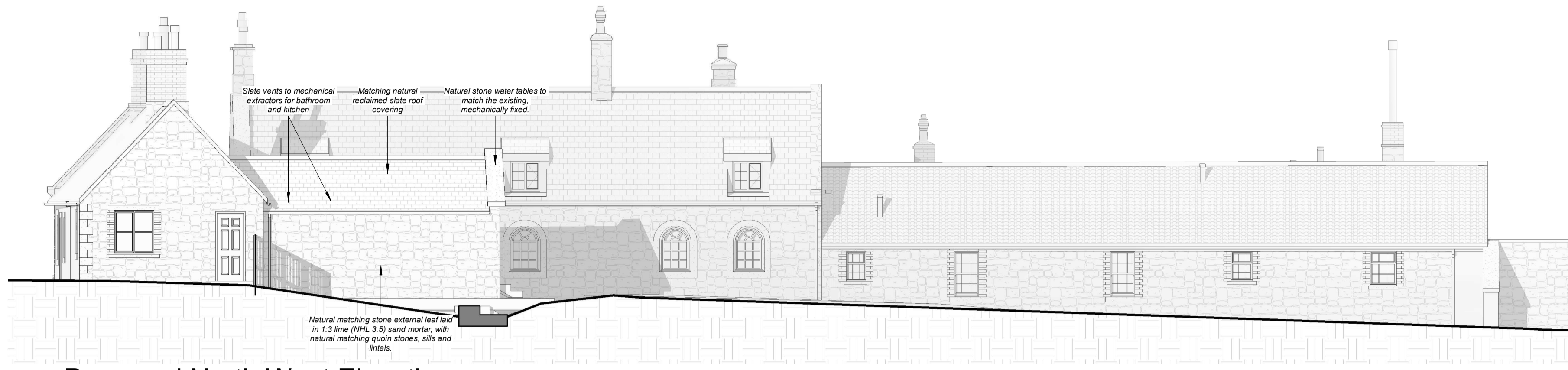
1 26.A1 Proposed North West Elevation 1 : 100