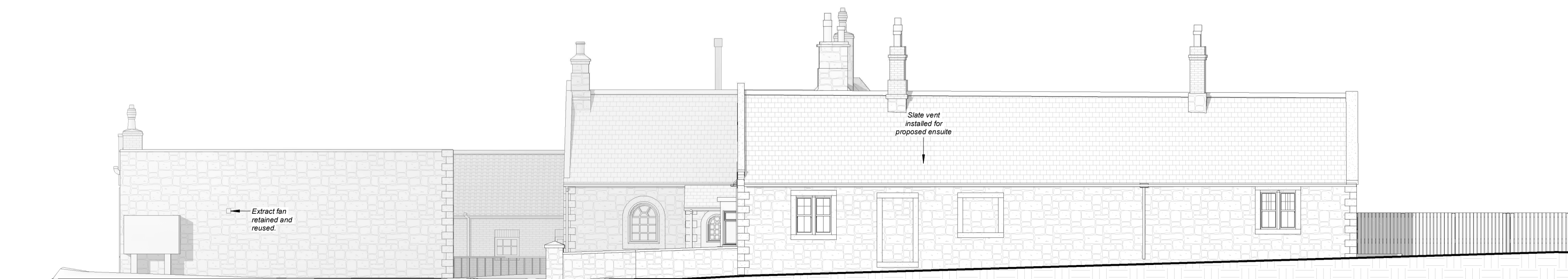
4 26.A1 Proposed South West Elevation 1 : 100