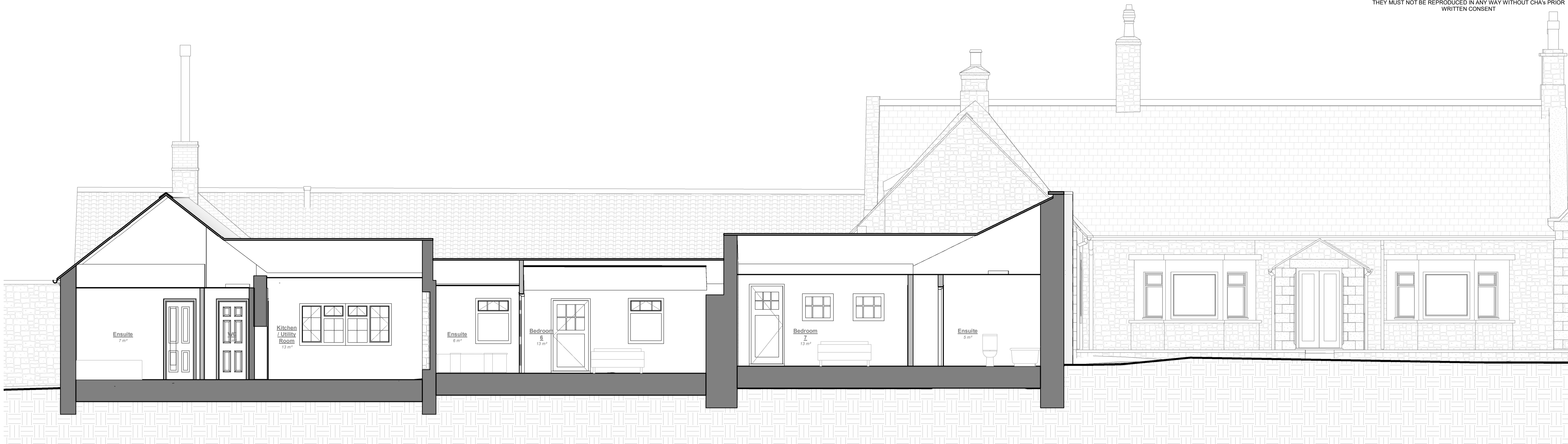
1 07.A1 Section 1 1:50

IF IN ANY DOUBT PLEASE ASK THE DESIGNER FOR CLARIFICATION DO NOT SCALE FROM DRAWINGS. ALL DIMENSIONS TO BE CHECKED ON SITE THE COPYRIGHT FOR THESE DRAWINGS REMAINS THE PROPERTY OF CHA. THEY MUST NOT BE REPRODUCED IN ANY WAY WITHOUT CHA'S PRIOR WRITTEN CONSENT