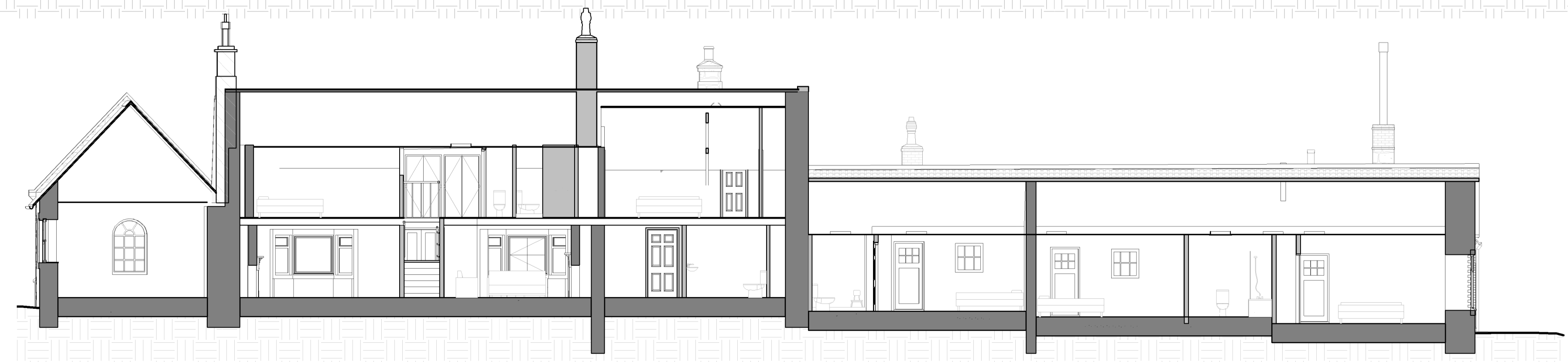
3 07.A1 Section 3 1:100