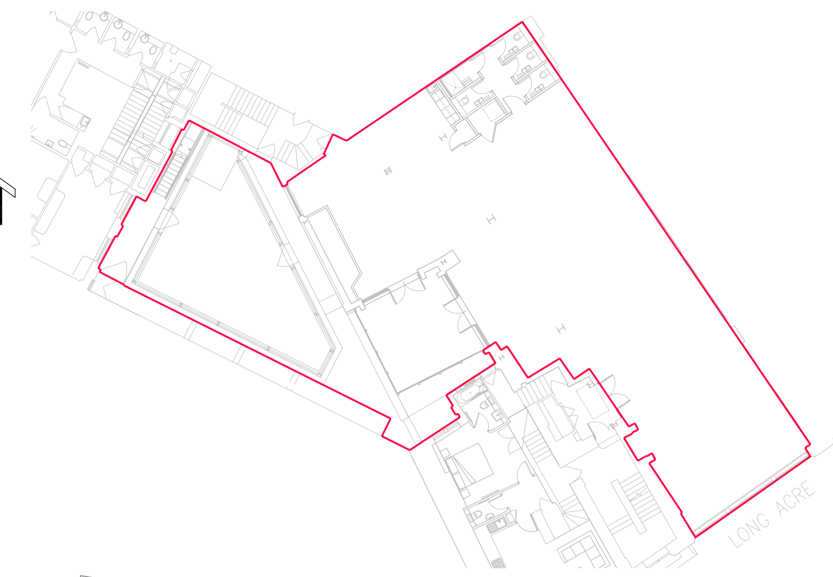
LOCATION PLAN SCALE 1:200