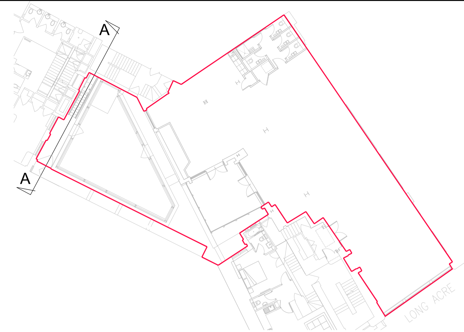
LOCATION PLAN SCALE 1:200

CONSTRUCTION (DESIGN AND MANAGEMENT) REGULATIONS 2015