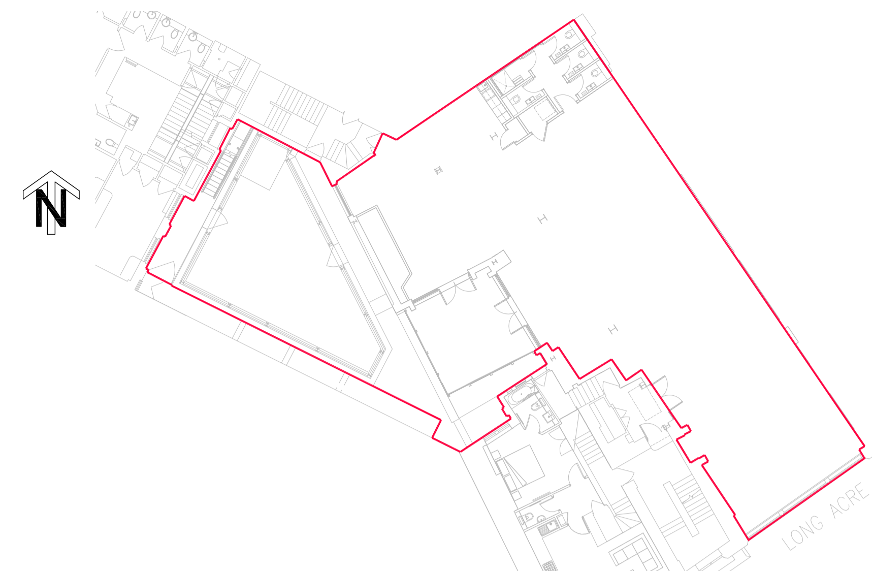
LOCATION PLAN SCALE 1:200