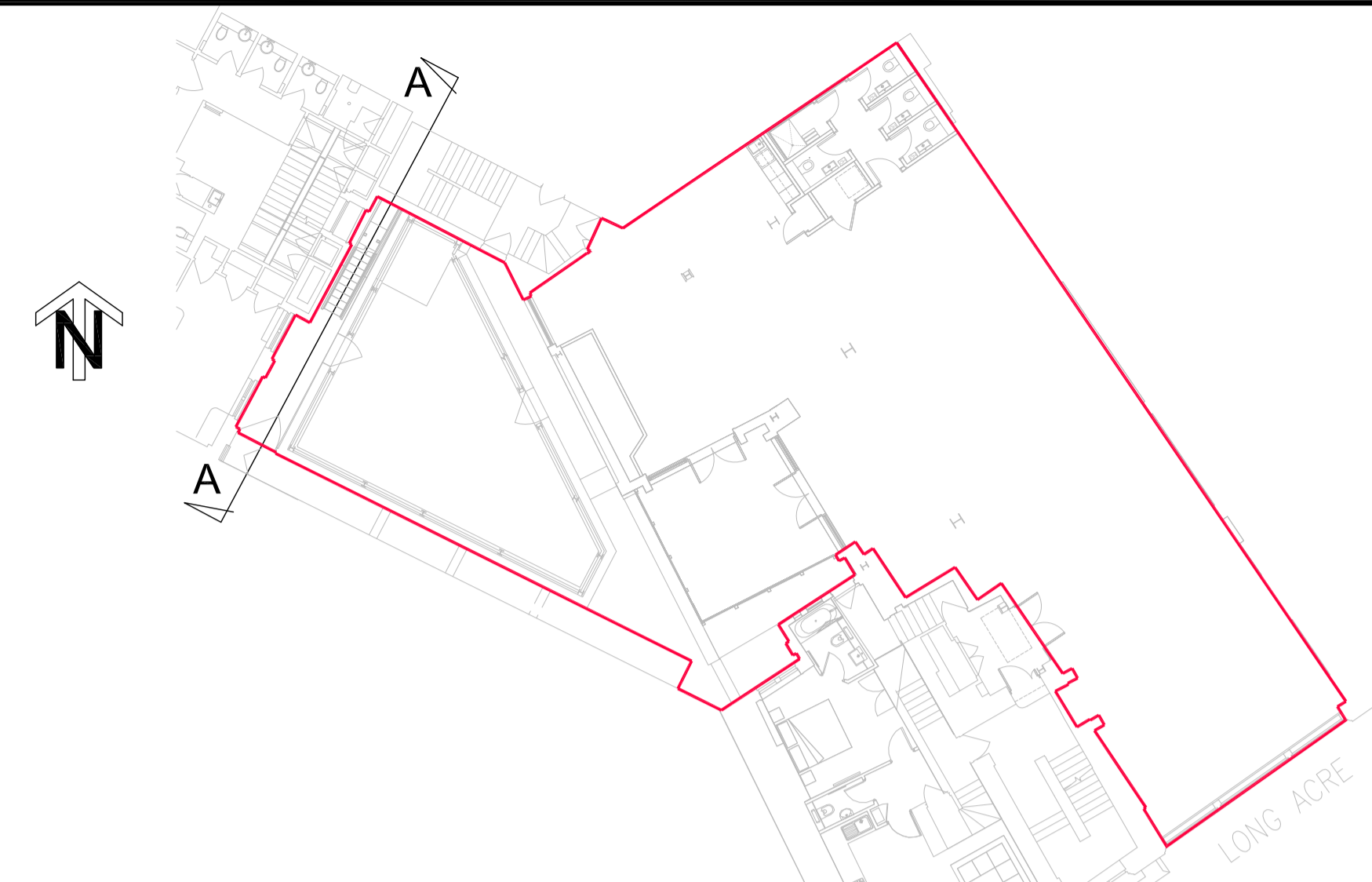
LOCATION PLAN SCALE 1:200