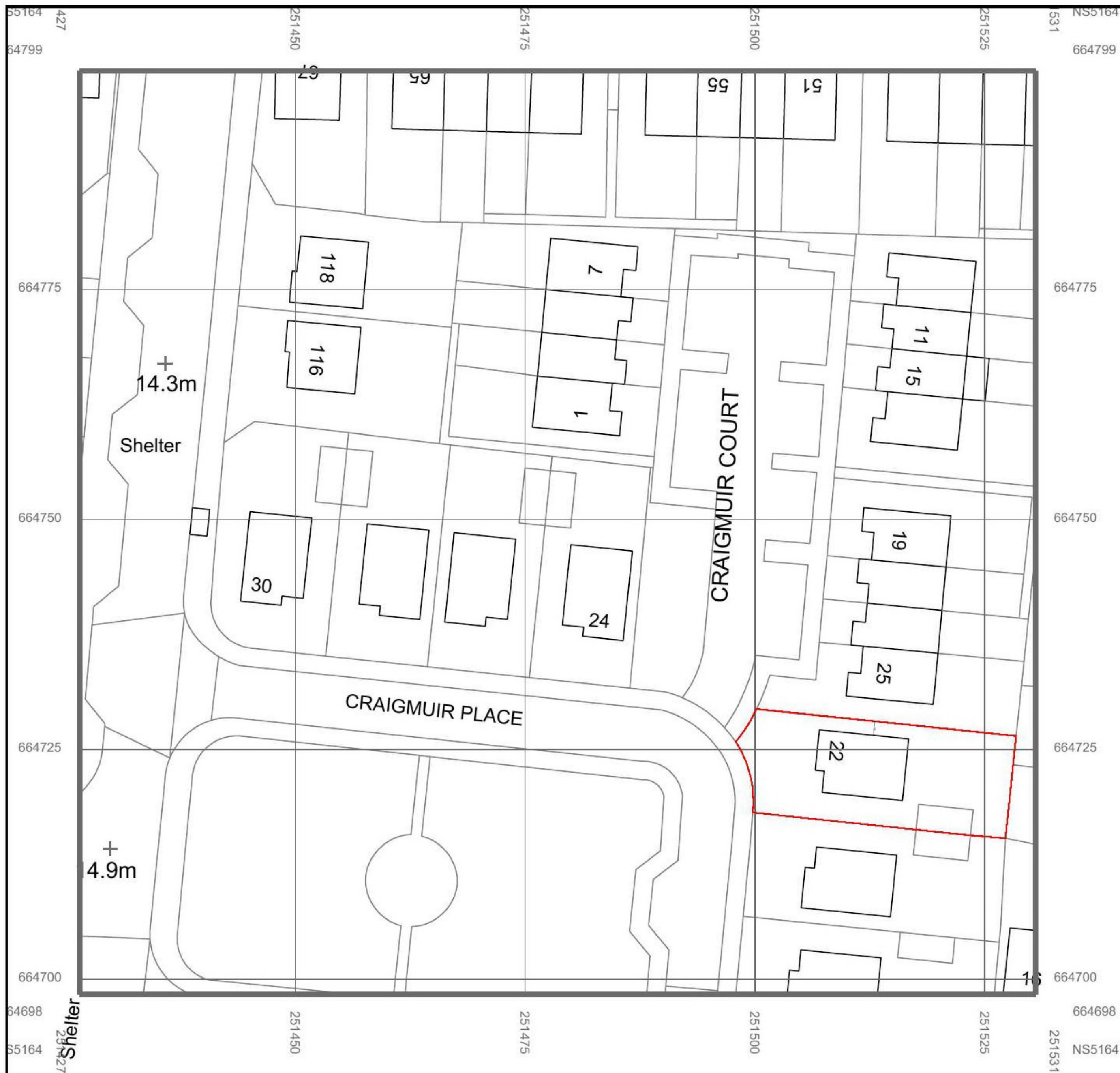
LOCATION PLAN 1:500