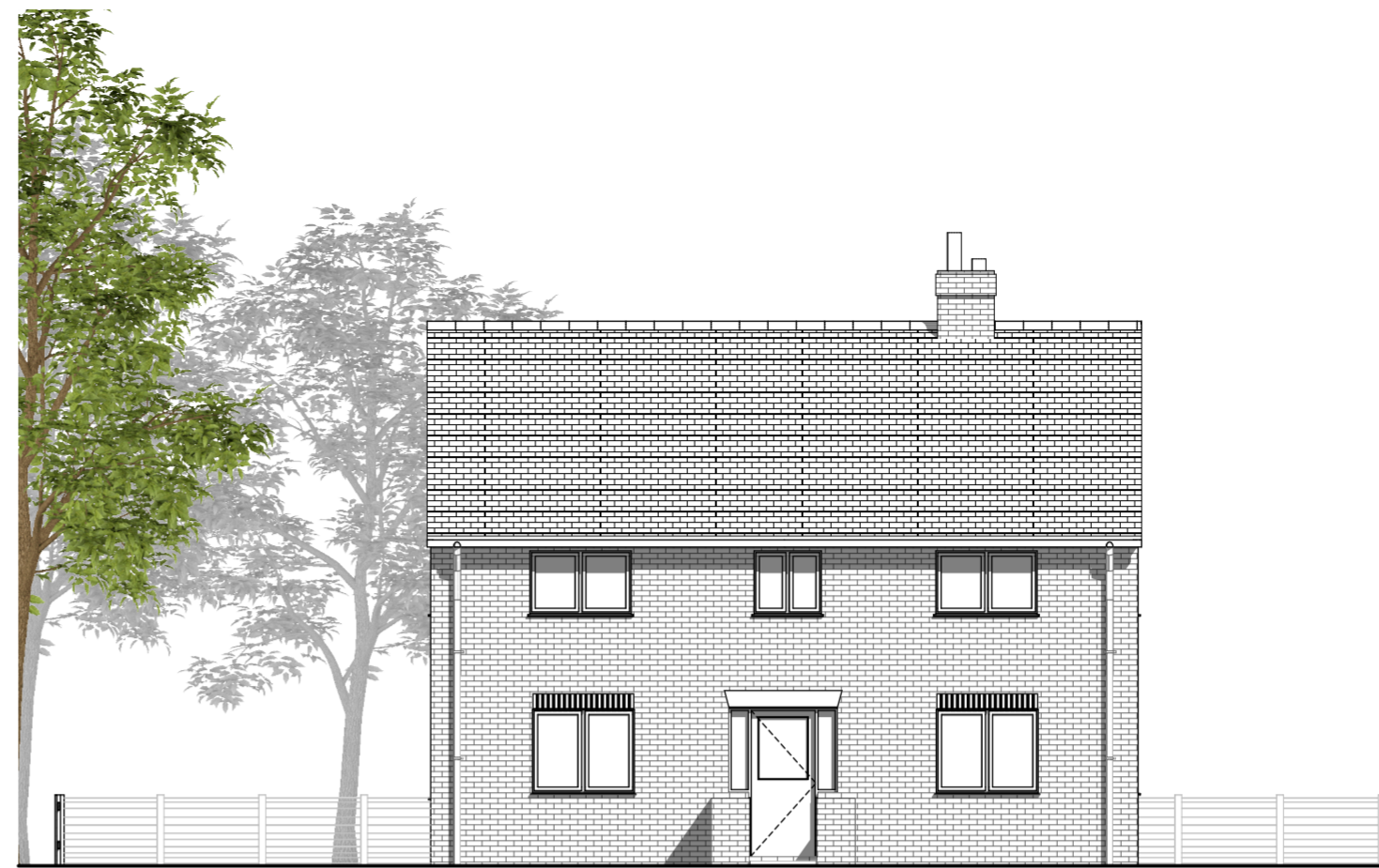
02 SOUTH WEST FACING FRONT ELEVATION AS EXISTING SCALE 1:100