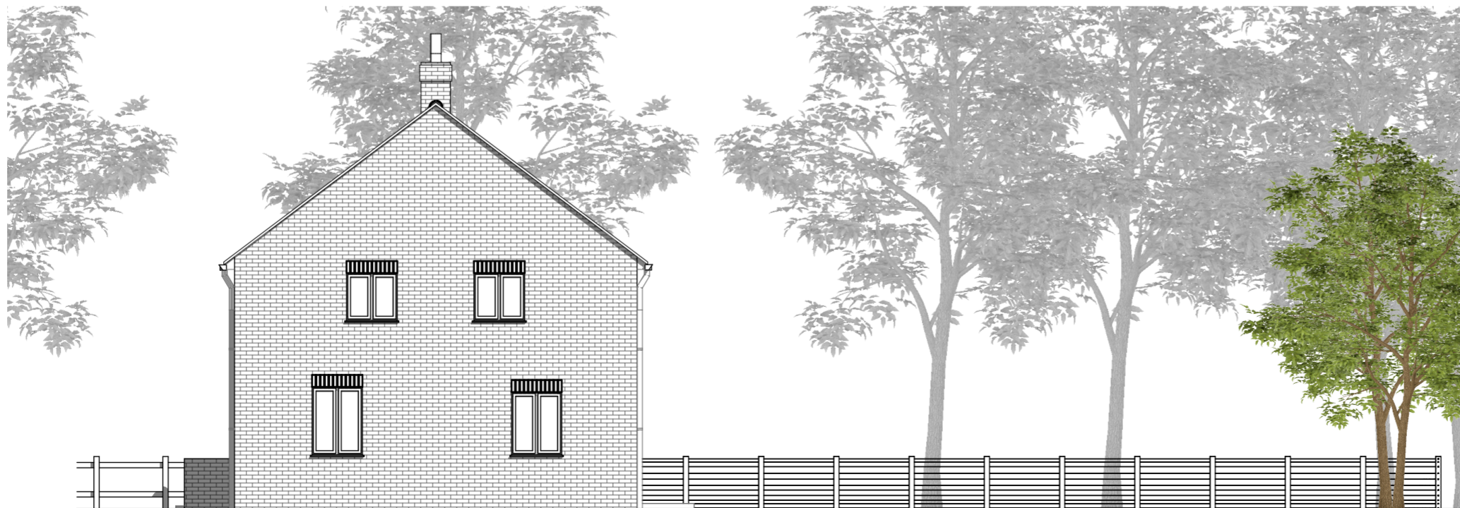
04 SOUTH EAST FACING SIDE ELEVATION AS EXISTING SCALE 1:100