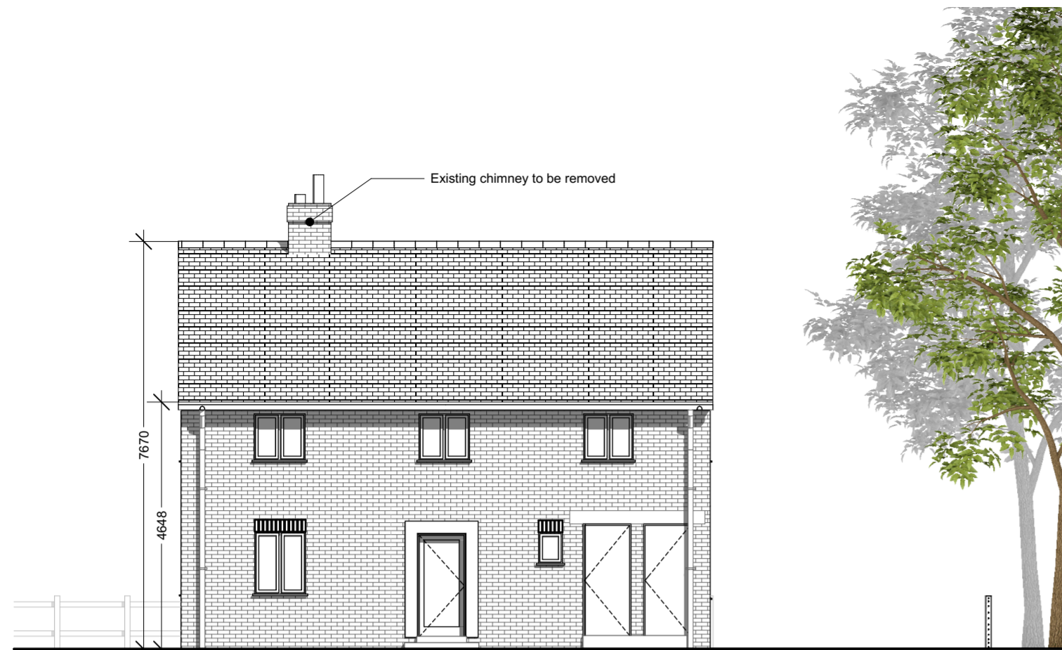
01 NORTH EAST FACING REAR ELEVATION AS EXISTING SCALE 1:100