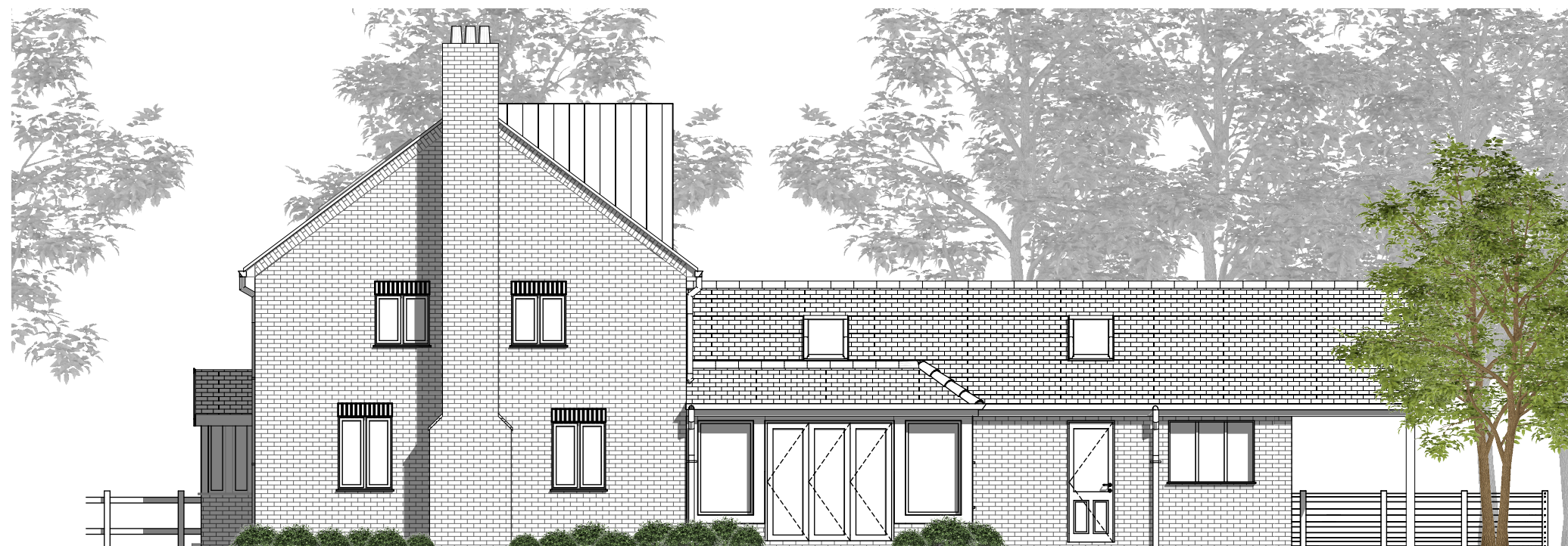
04 SOUTH EAST FACING SIDE ELEVATION AS PROPOSED SCALE 1:100