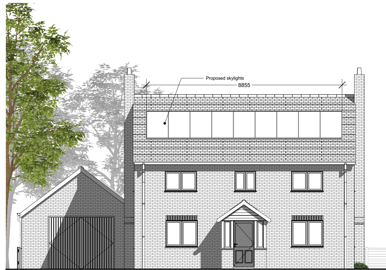
02 SOUTH WEST FACING FRONT ELEVATION AS PROPOSED SCALE 1:100