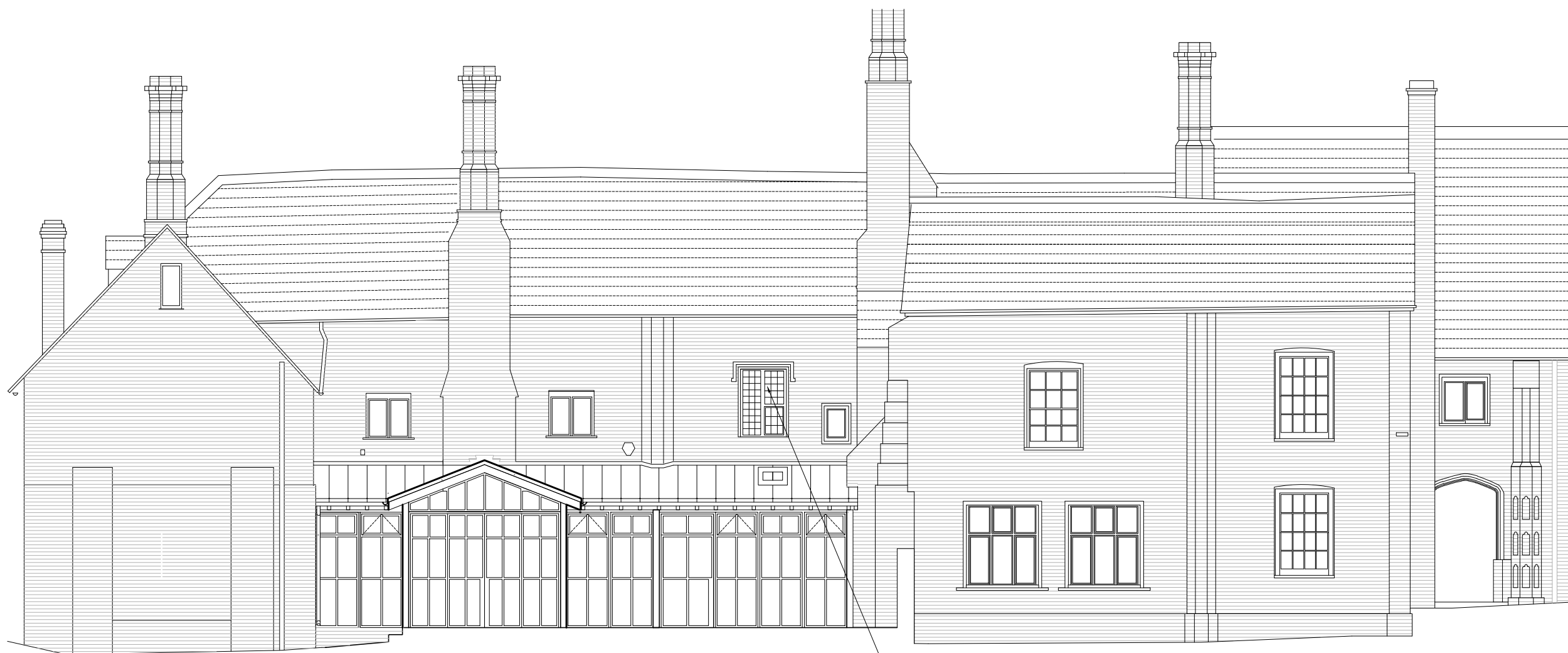
East elevation, as proposed