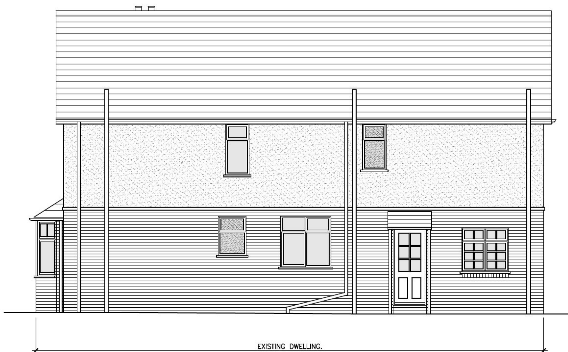
EXISTING SIDE ELEVATION SCALE 1:50