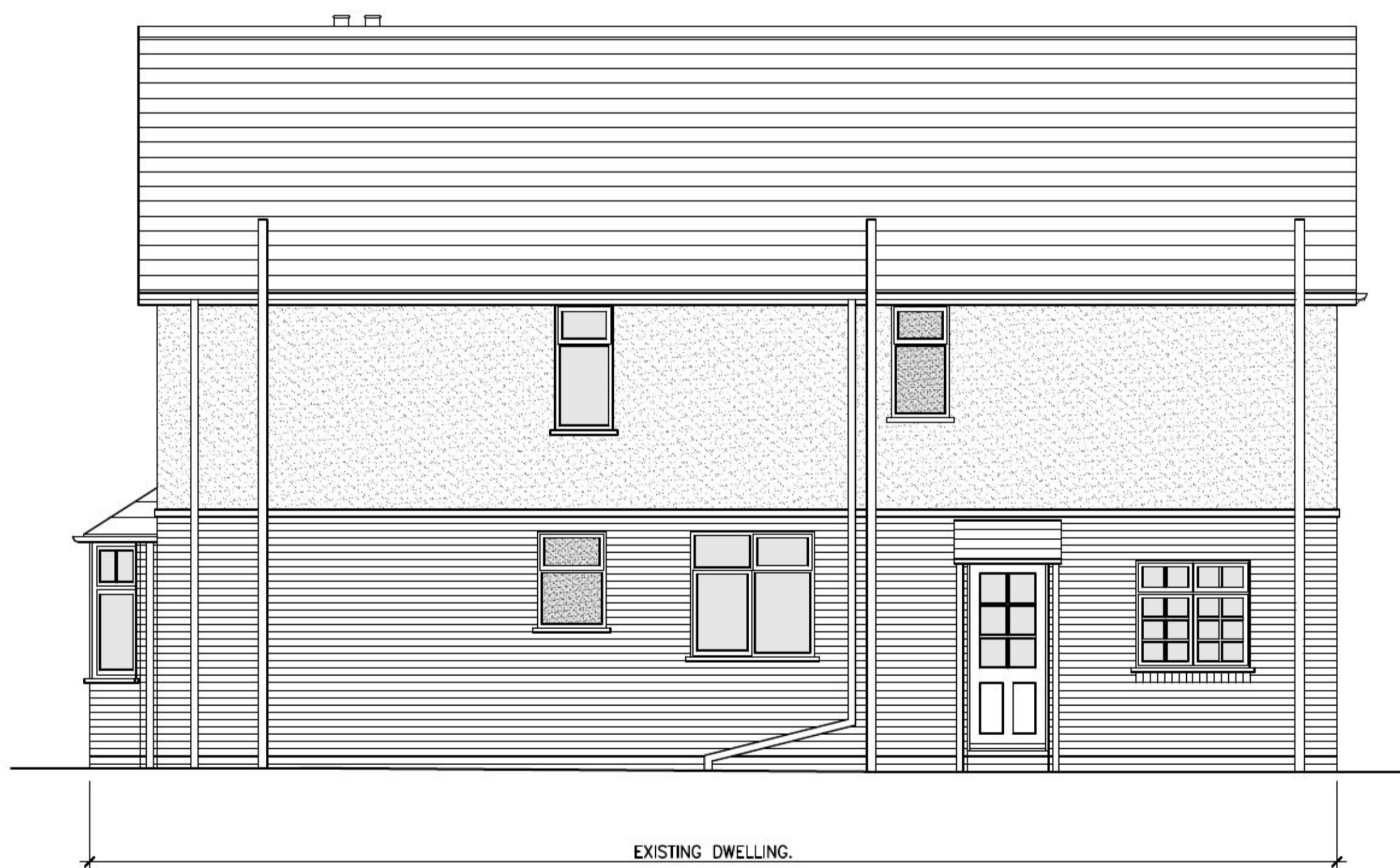
EXISTING SIDE ELEVATION SCALE 1:50 REMAINS THE SAME.