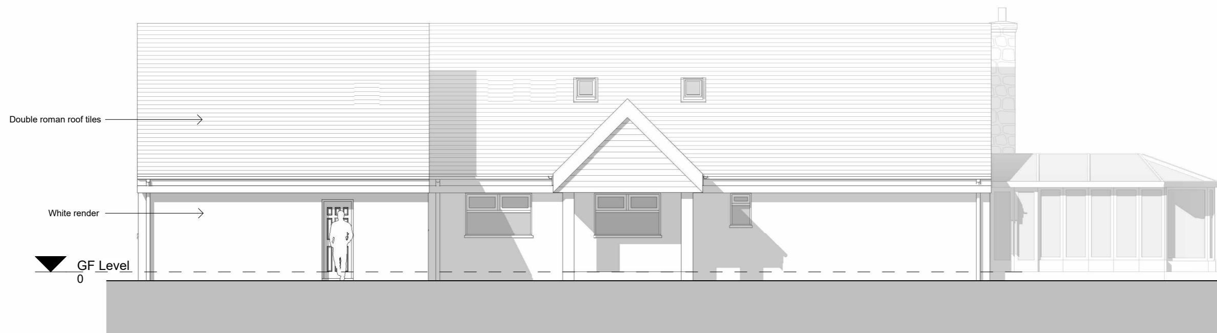
1 EXISTING SOUTH ELEVATION SCALE: 1:100