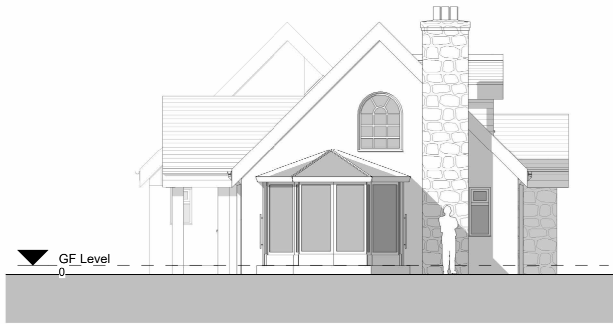
1 EXISTING EAST ELEVATION 021 SCALE: 1 : 100