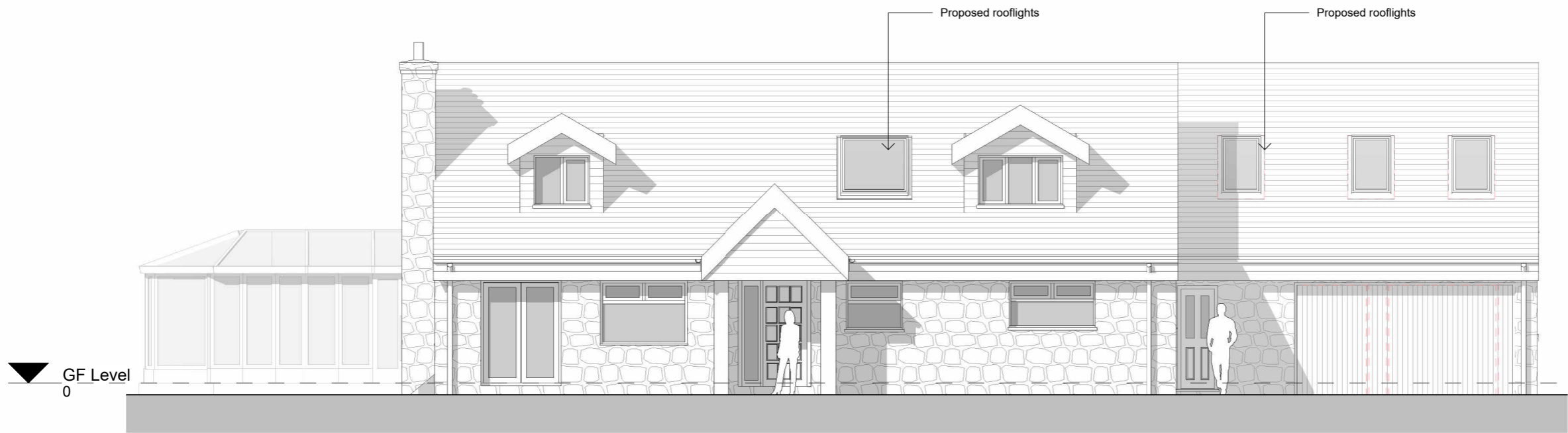
1 PROPOSED SOUTH ELEVATION SCALE: 1:100