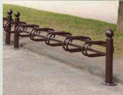
4. Bike Rack Decorative Modular - Single sided 6 spaces - Black colour