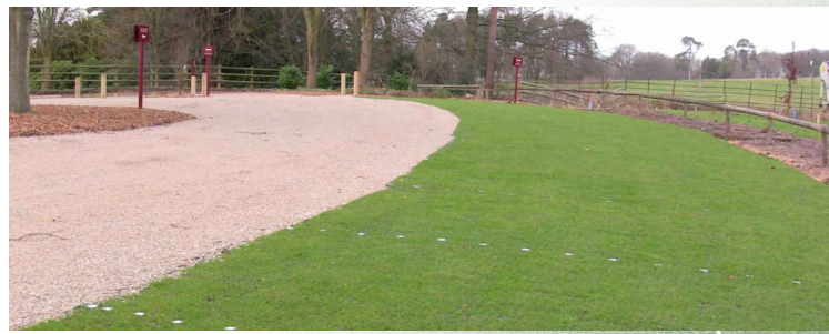
1. Grass reinstated for car park