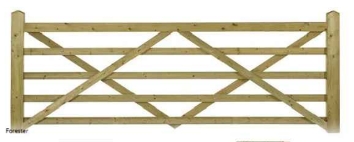
2. Field gates connecting paddocks and car park (access by church includes a pedestrian gate)