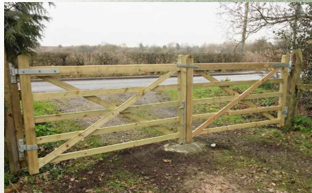
3. Double gates located at exit point onto road