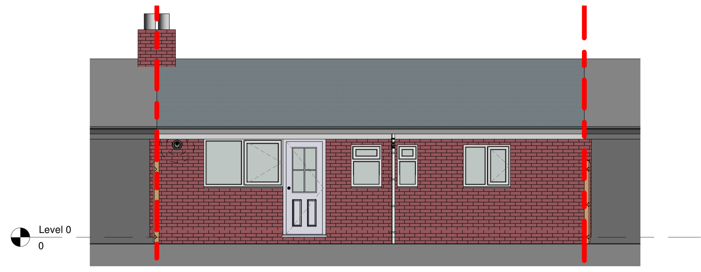
E2 0560 - Existing Rear Elevation 1 : 50