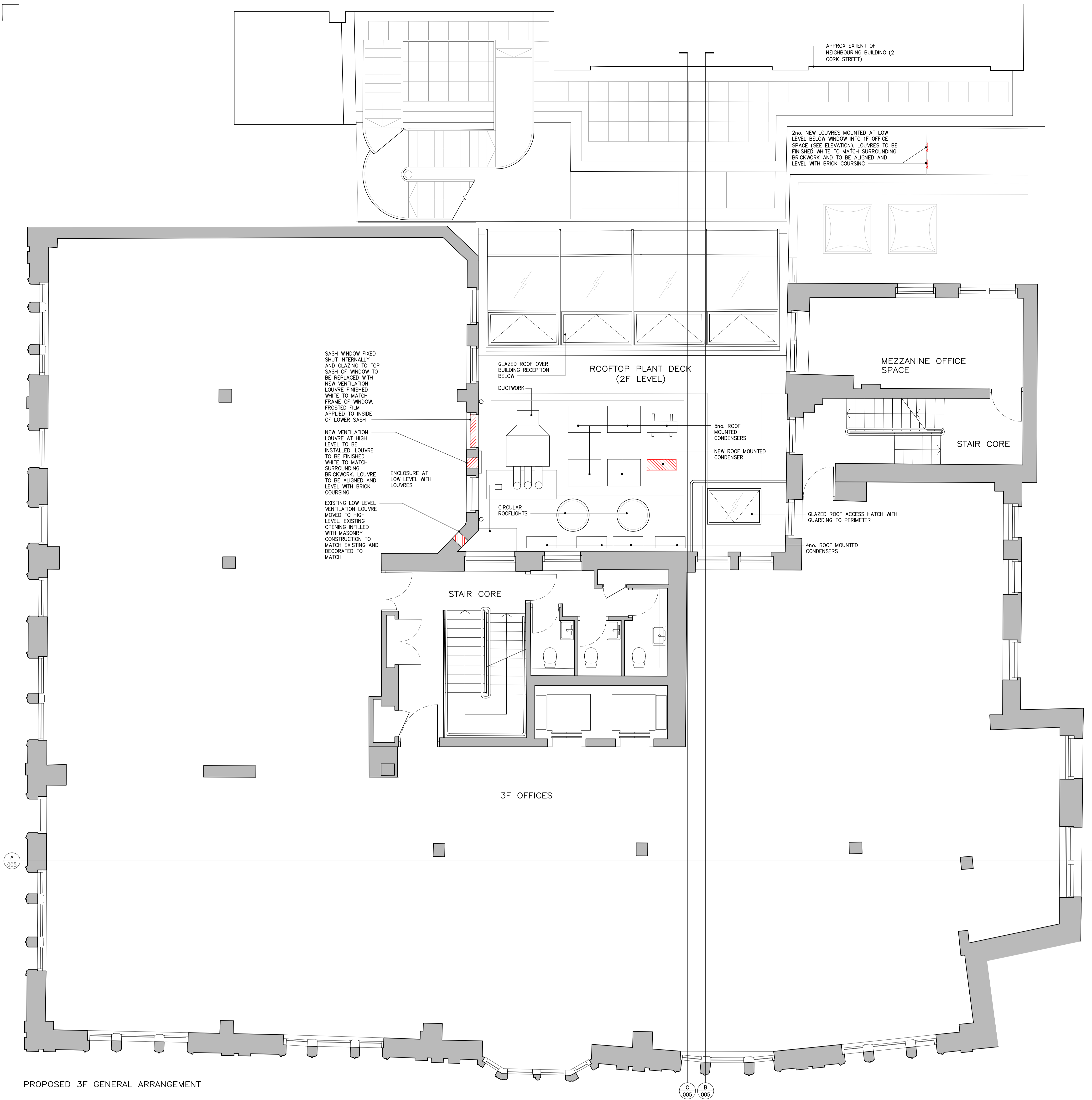
PROPOSED 3F GENERAL ARRANGEMENT

ANY DISCREPANCIES FOUND ON THE DRAWINGS, SPECIFICATIONS OR ON SITE TO BE COMMUNICATED IMMEDIATELY AND PRIOR TO COMMENCEMENT OR CONTINUATION OF WORKS.