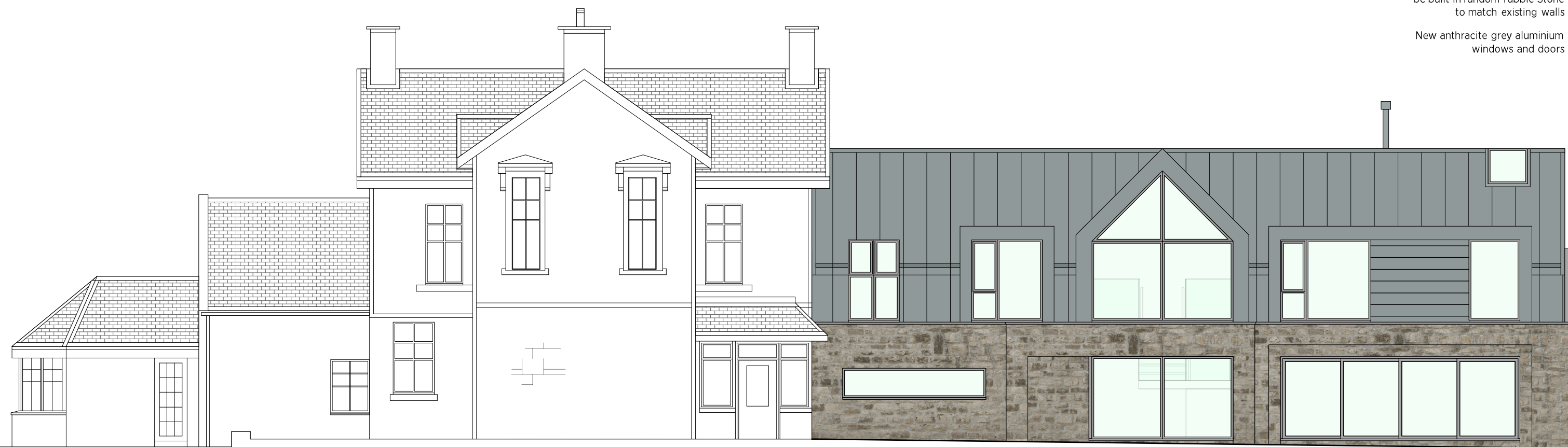
South Elevation as Proposed, 1:100

New anthracite grey aluminium windows and doors