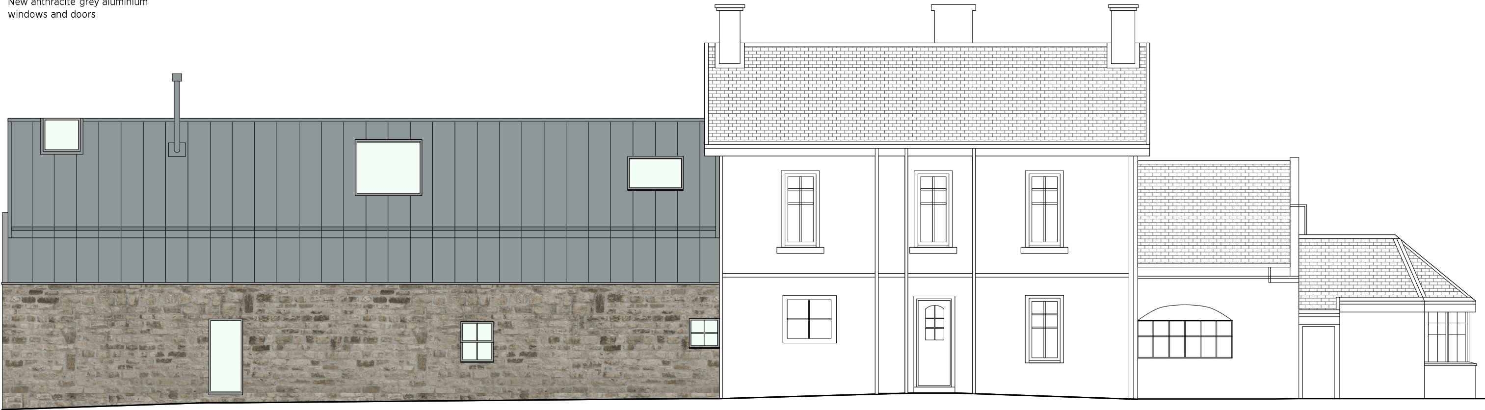
North Elevation as Proposed, 1:100

New anthracite grey aluminium windows and doors