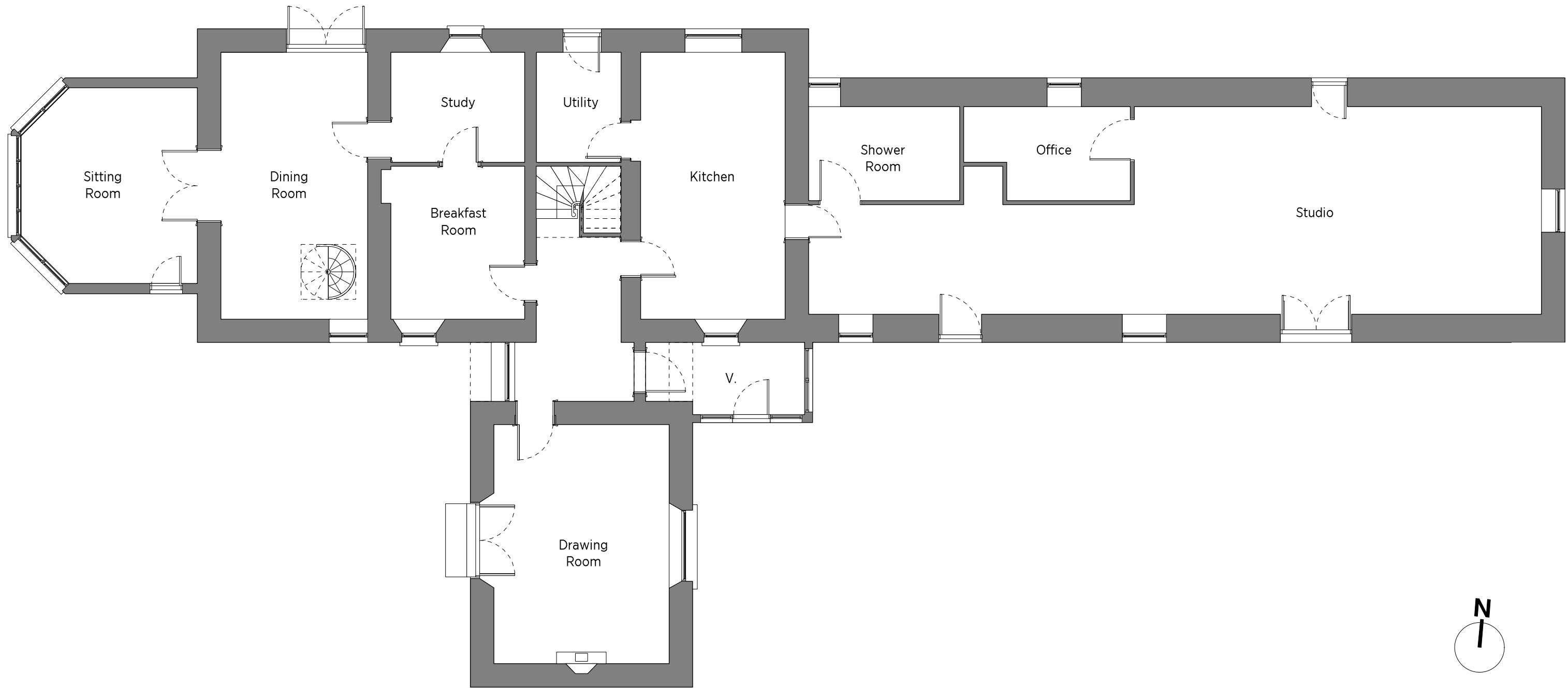
Ground Floor Plan as Existing, 1:100