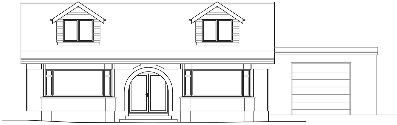
Front (North) Elevation