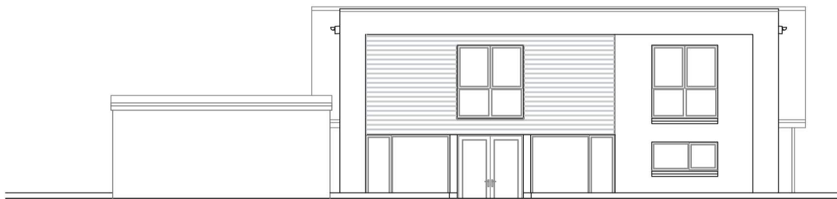
Rear (South) Elevation