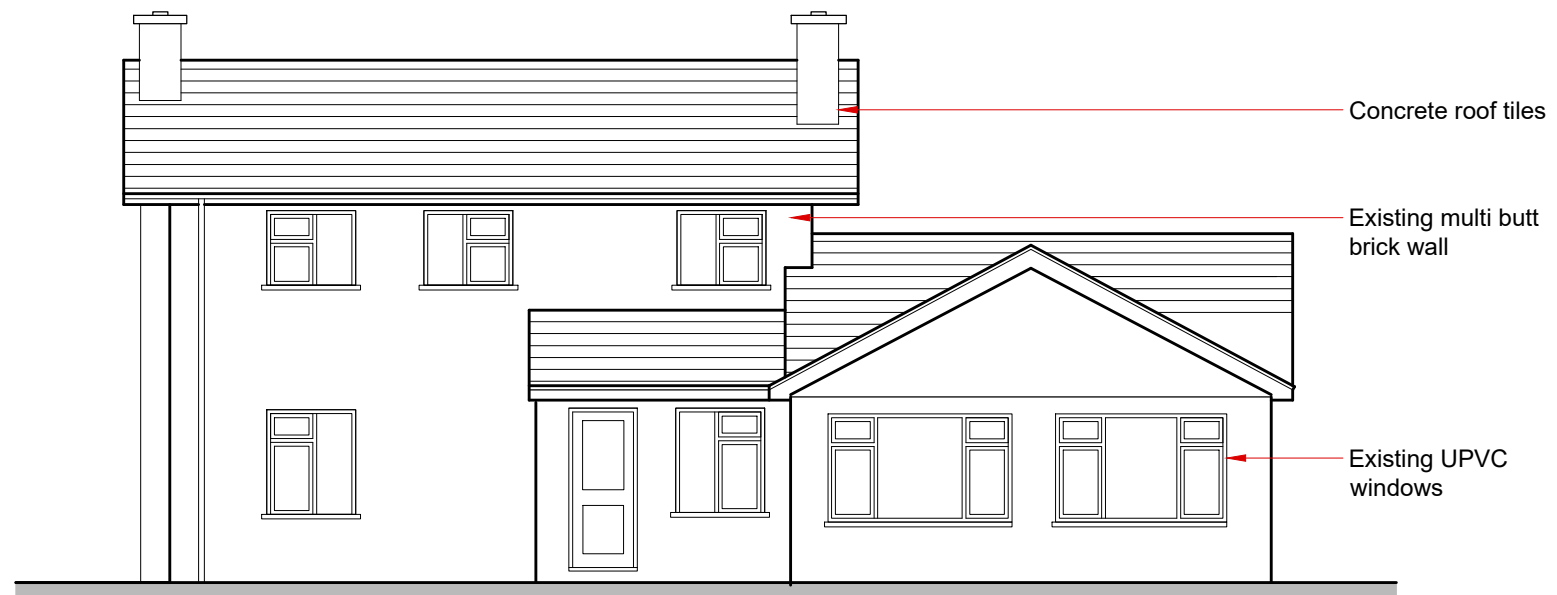
Existing South Elevation SCALE 1:100 @ A3