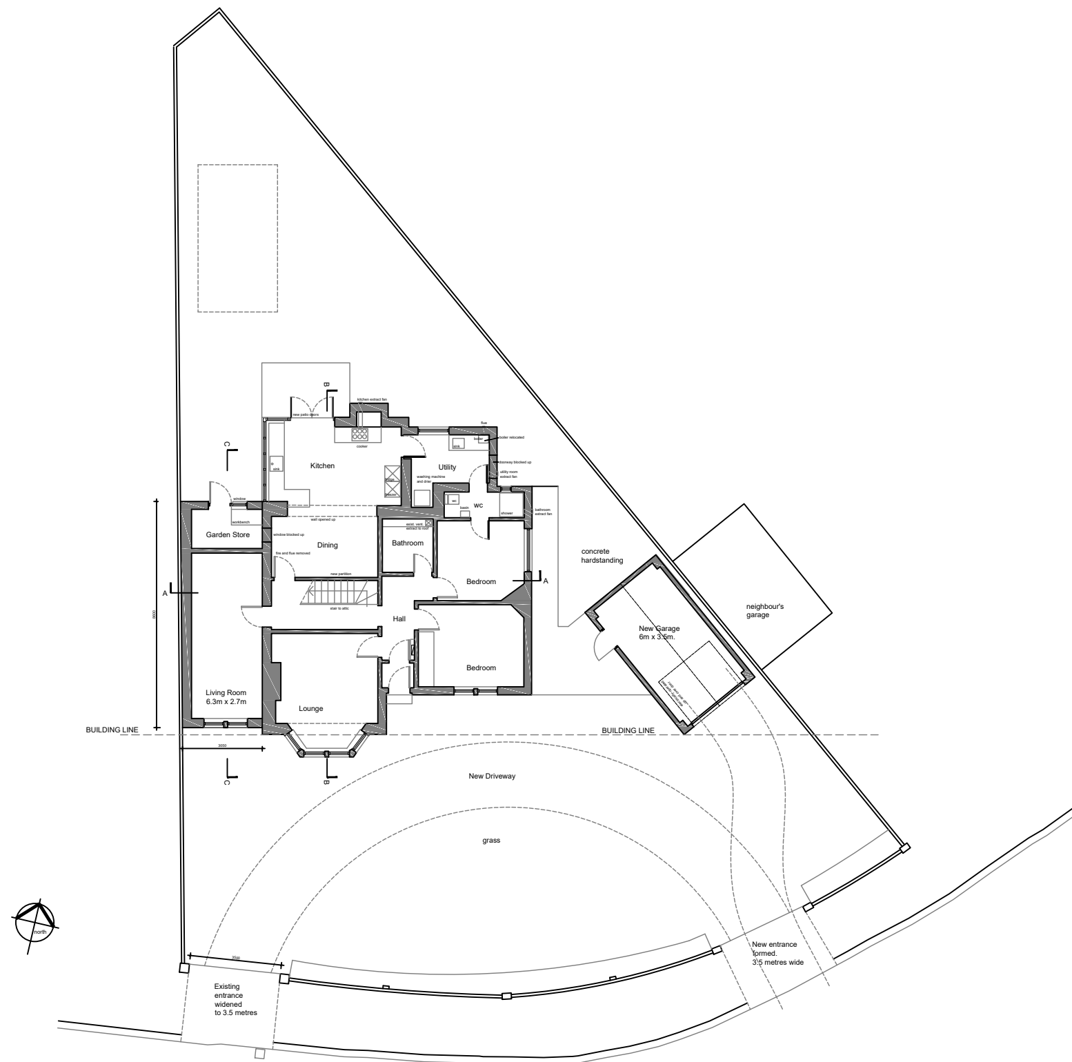
Site Plan as Proposed 1 : 200