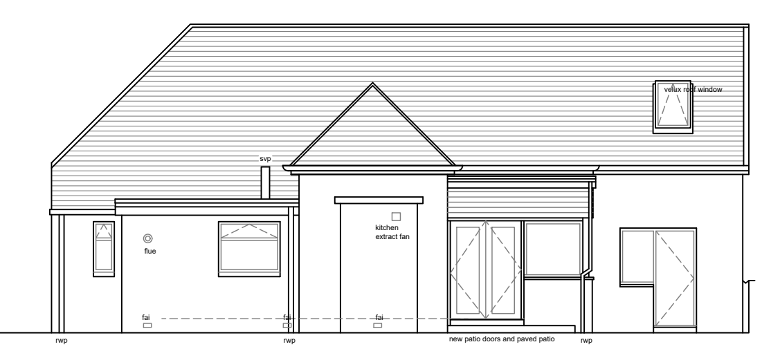
Rear Elevation 1:100