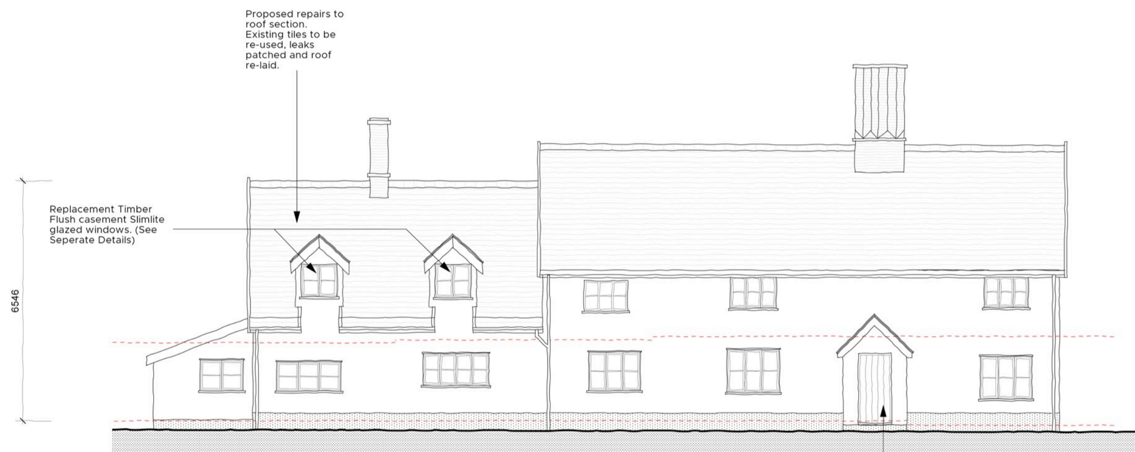
PROPOSED SOUTH ELEVATION (FRONT)