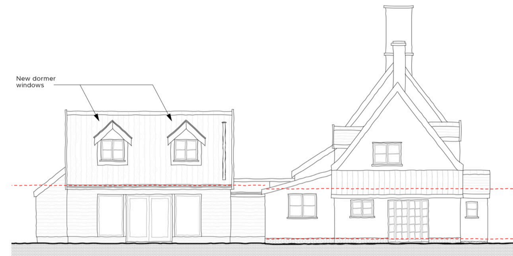
PROPOSED WEST ELEVATION (SIDE)