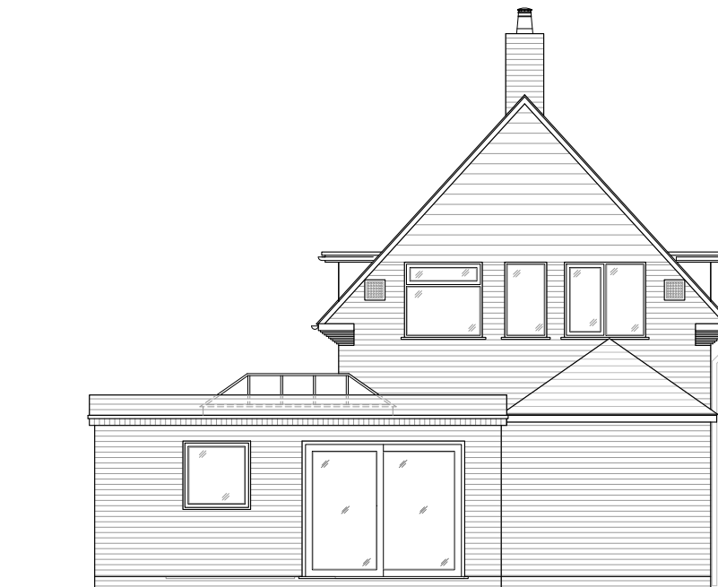
Left Side Elevation As proposed