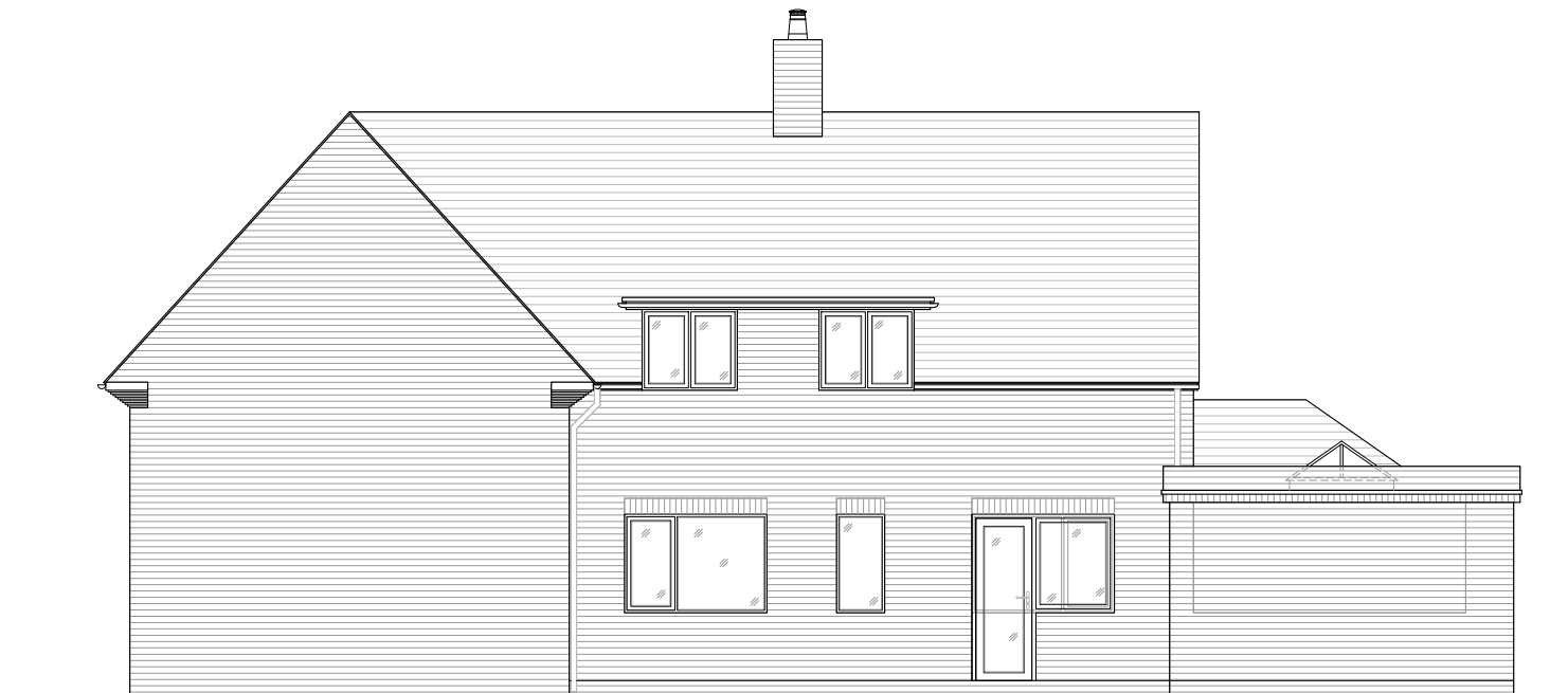
Rear Elevation As proposed