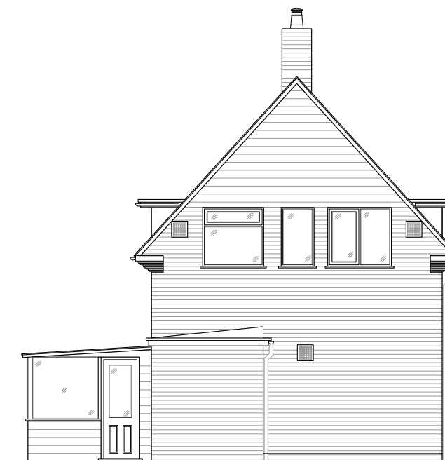
Left Side Elevation As Existing