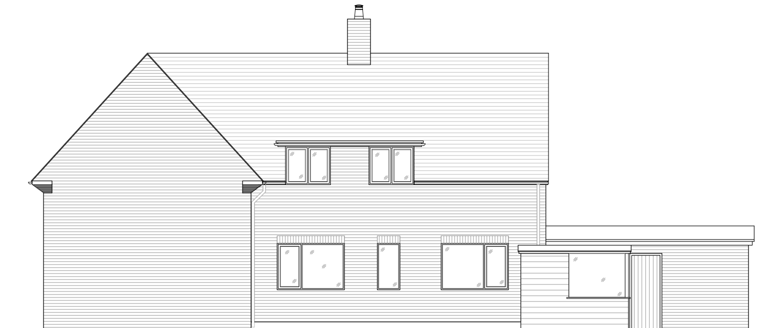
Rear Elevation As Existing