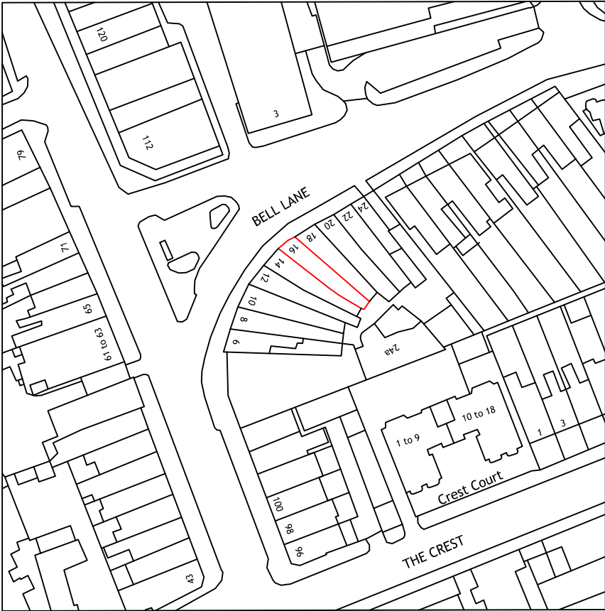
OS MAP SCALE 1:1250