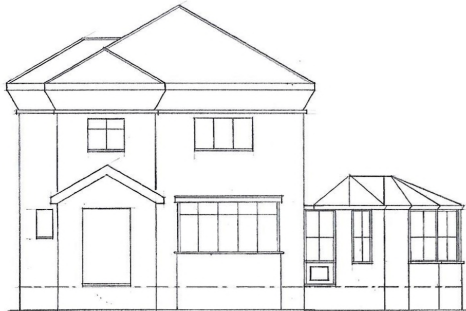
PROPOSED SW ELEVATION (FRONT)