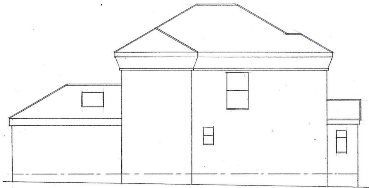
EXISTING NW ELEVATION UNCHANGED (SIDE)