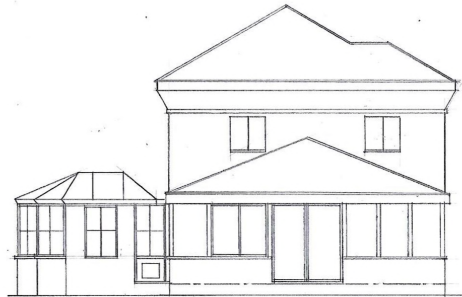
PROPOSED NE ELEVATION (REAR)