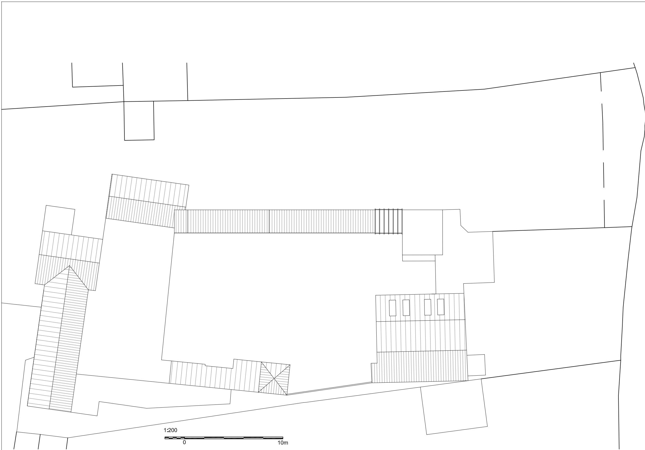
EXISTING ROOF PLAN Scale 1:200