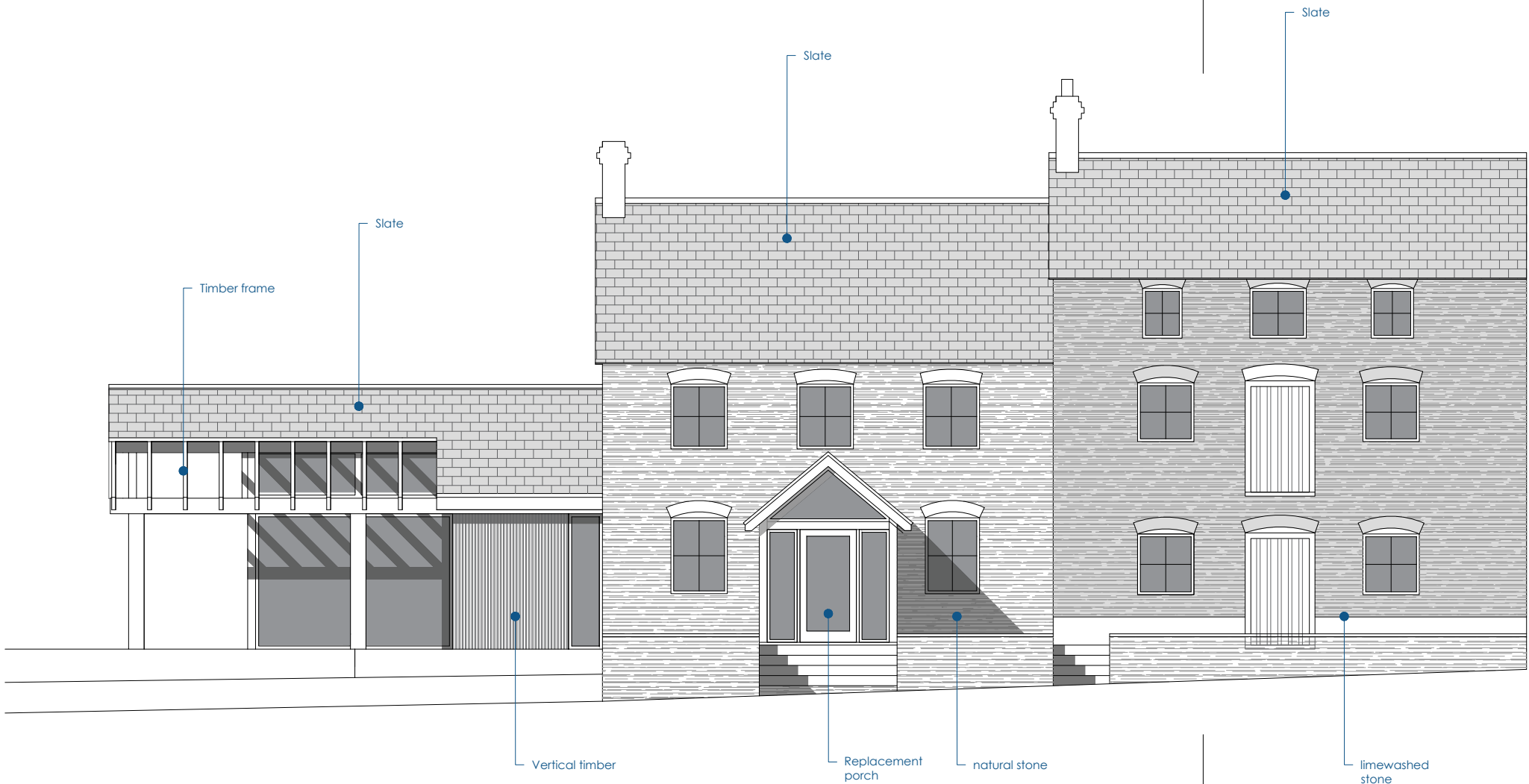
1:100 South Elevation