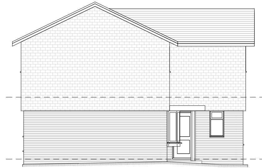
SIDE ELEVATION (WEST)