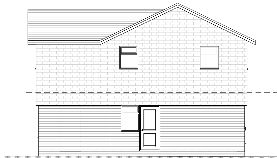
SIDE ELEVATION (EAST)