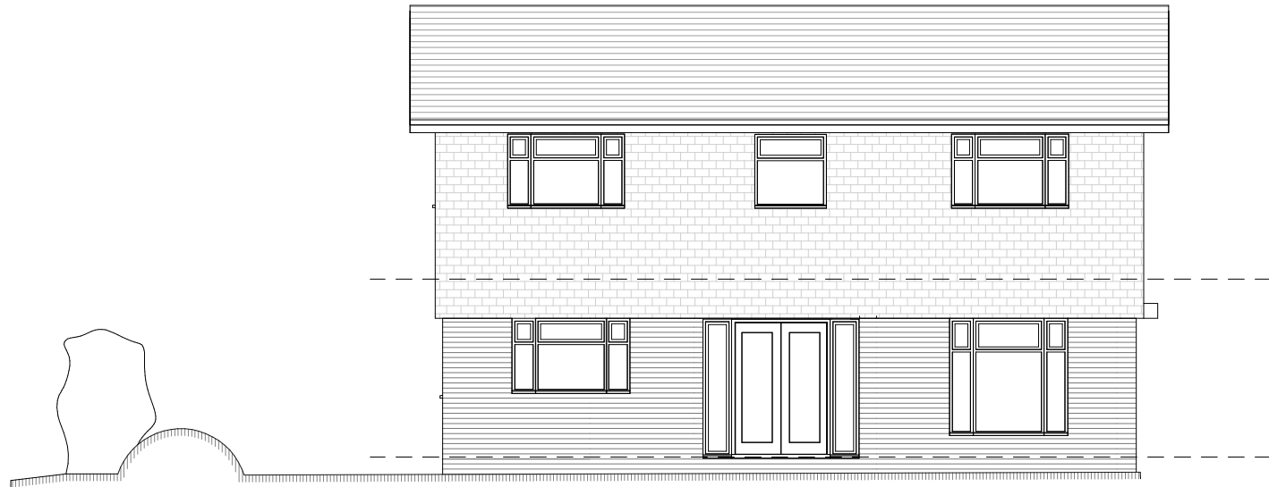
REAR ELEVATION (NORTH)