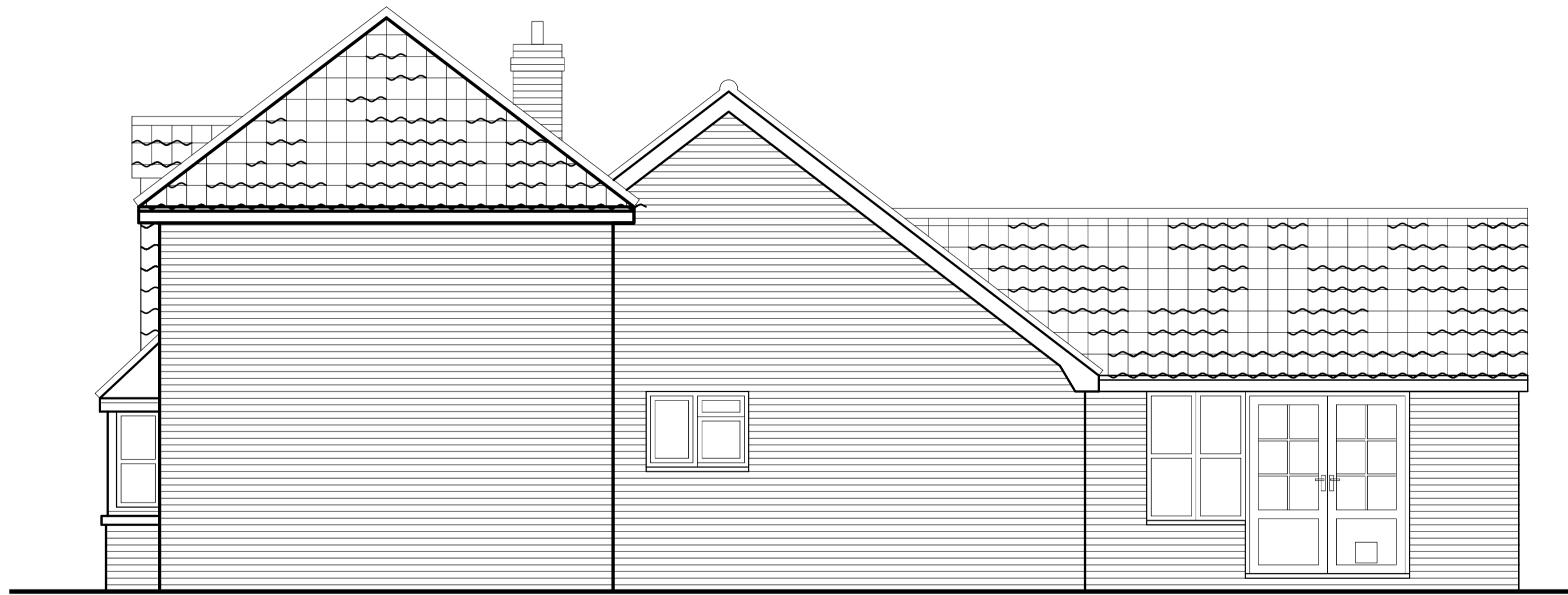
EXISTING SIDE (SOUTH) ELEVATION SCALE 1:50 AT A1