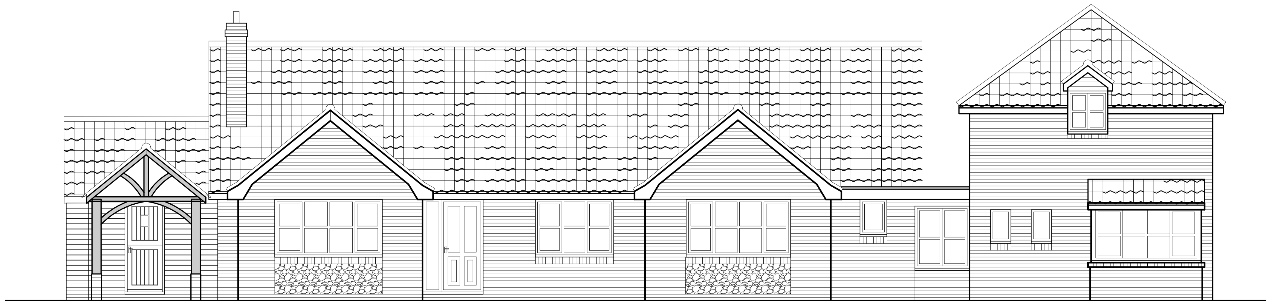
EXISTING FRONT ELEVATION SCALE 1:50 AT A1