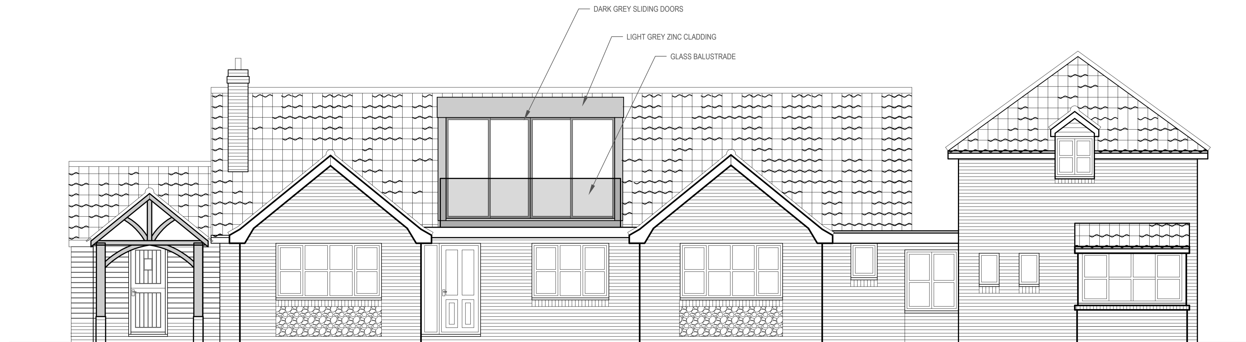
PROPOSED FRONT ELEVATION SCALE 1:50 AT A1