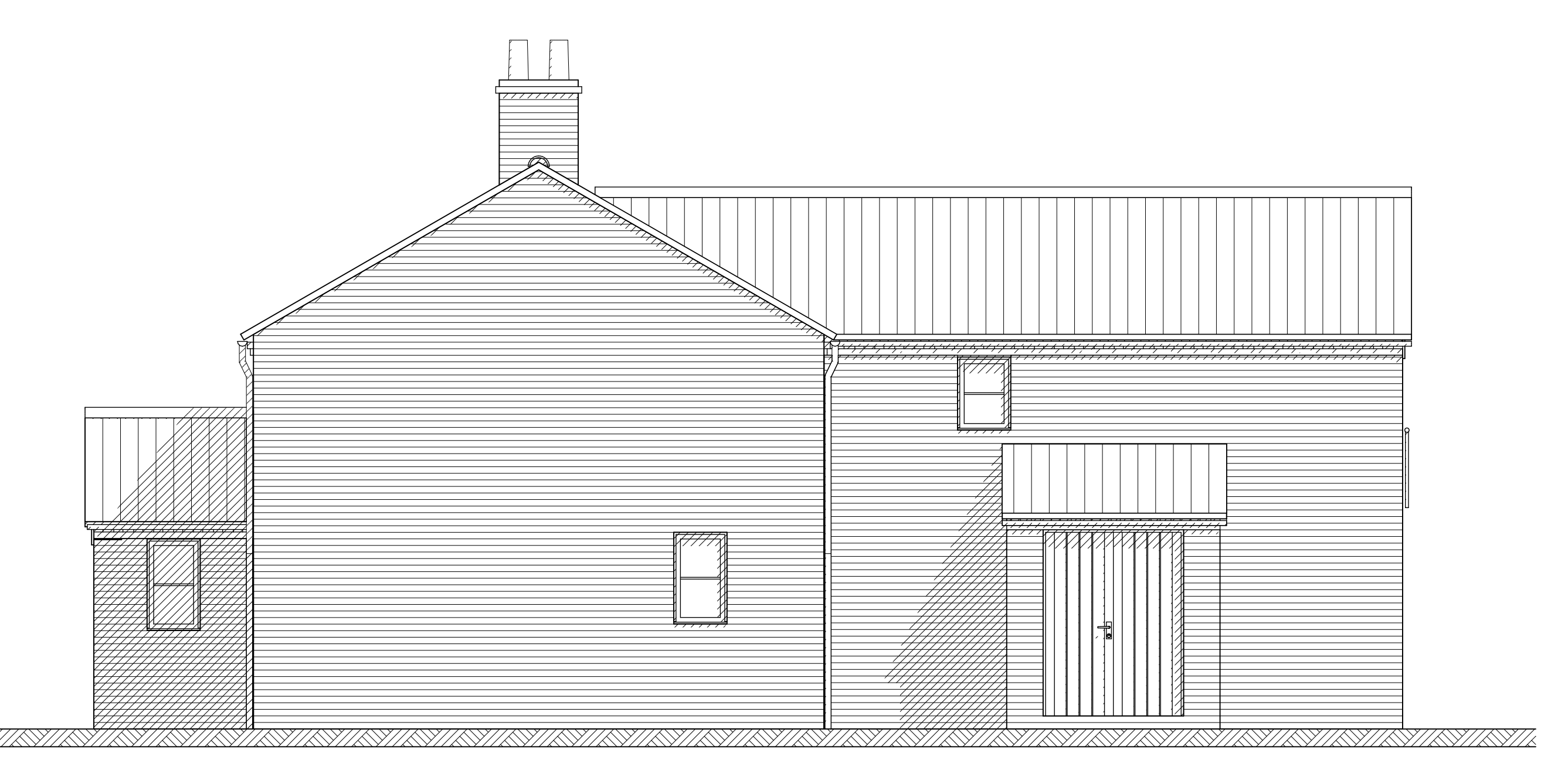
North elevation proposed