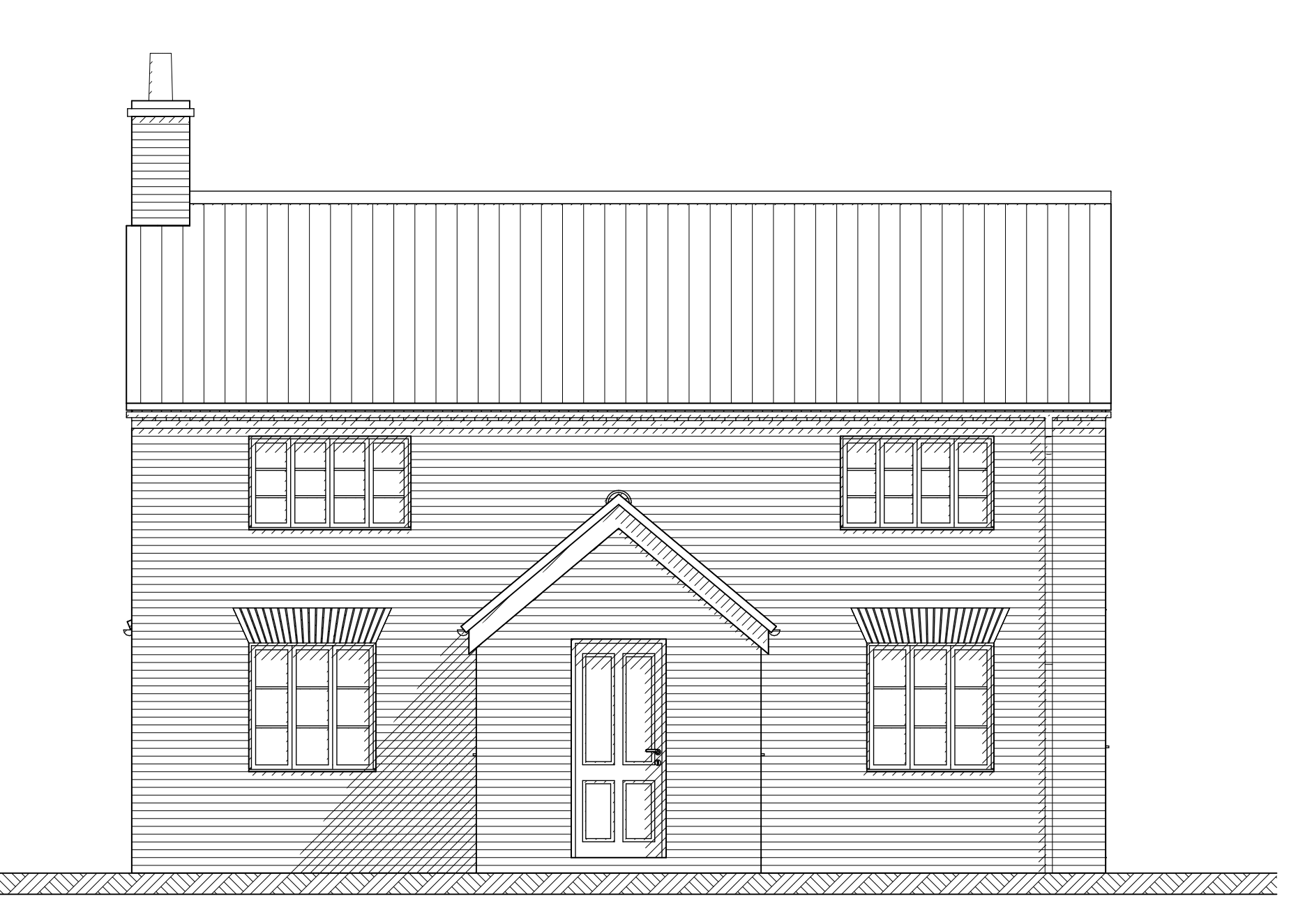
East elevation proposed