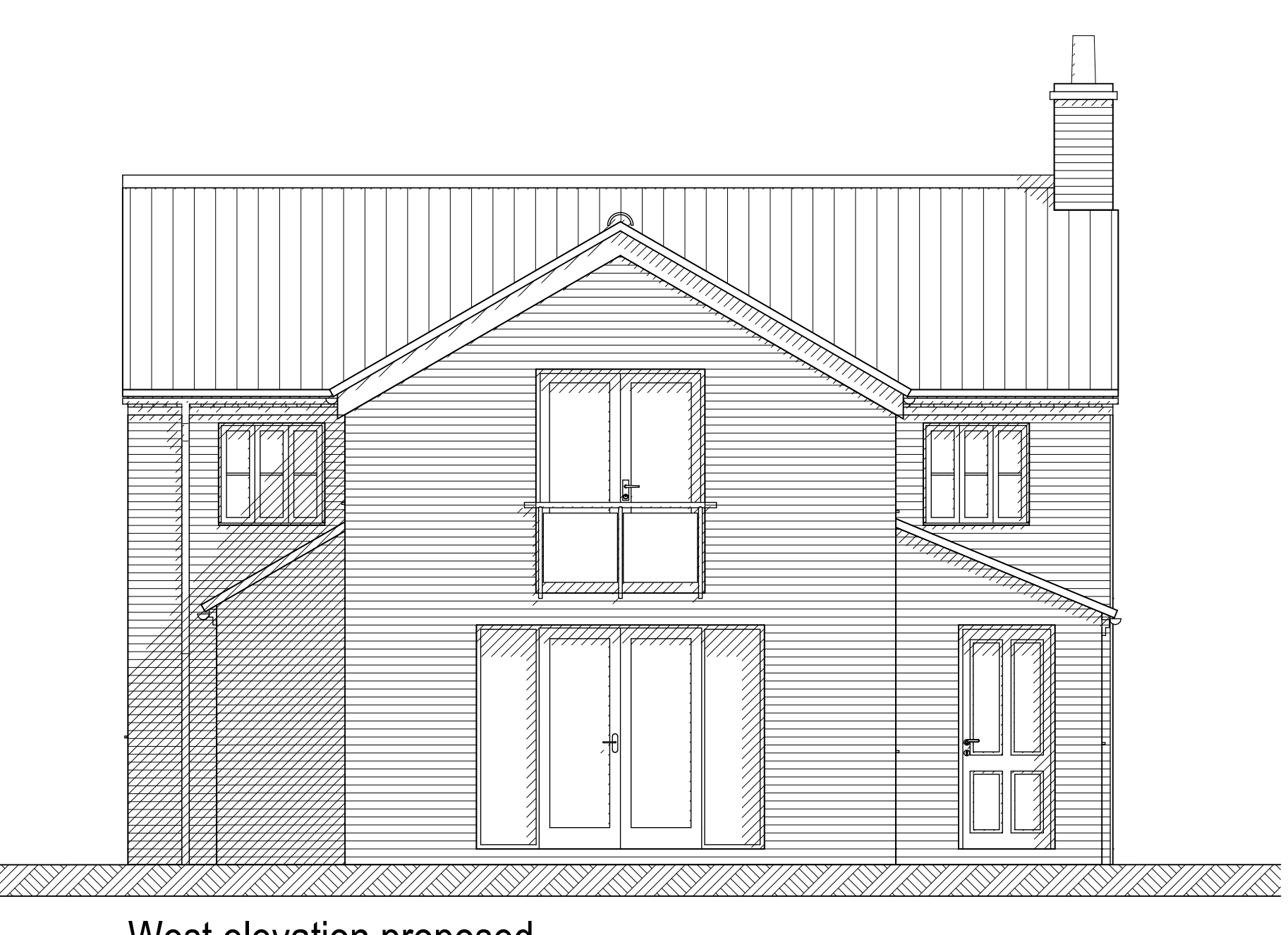
West elevation proposed