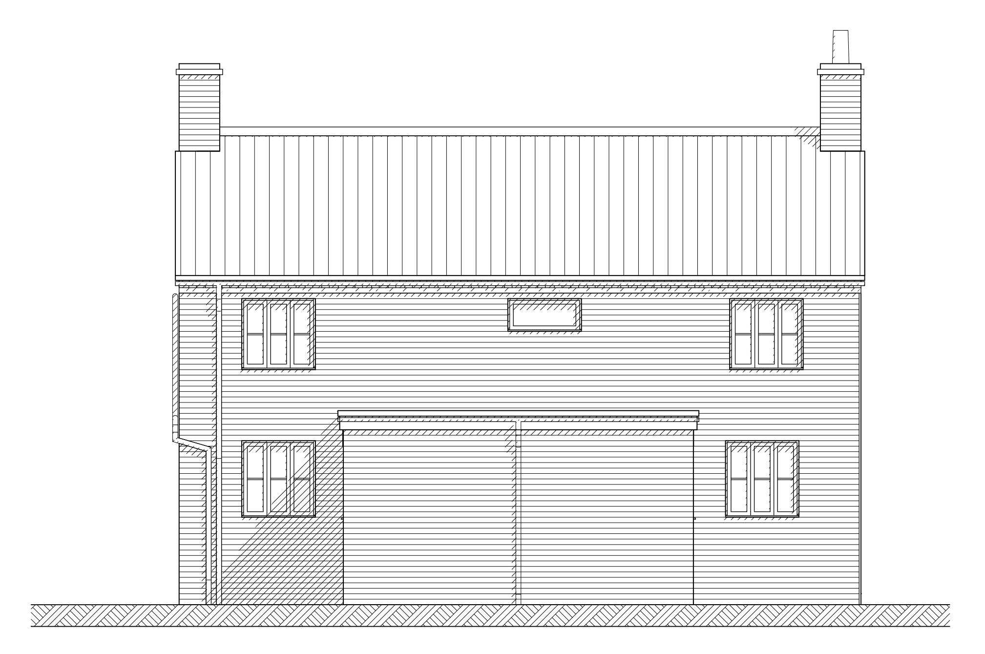
West elevation existing