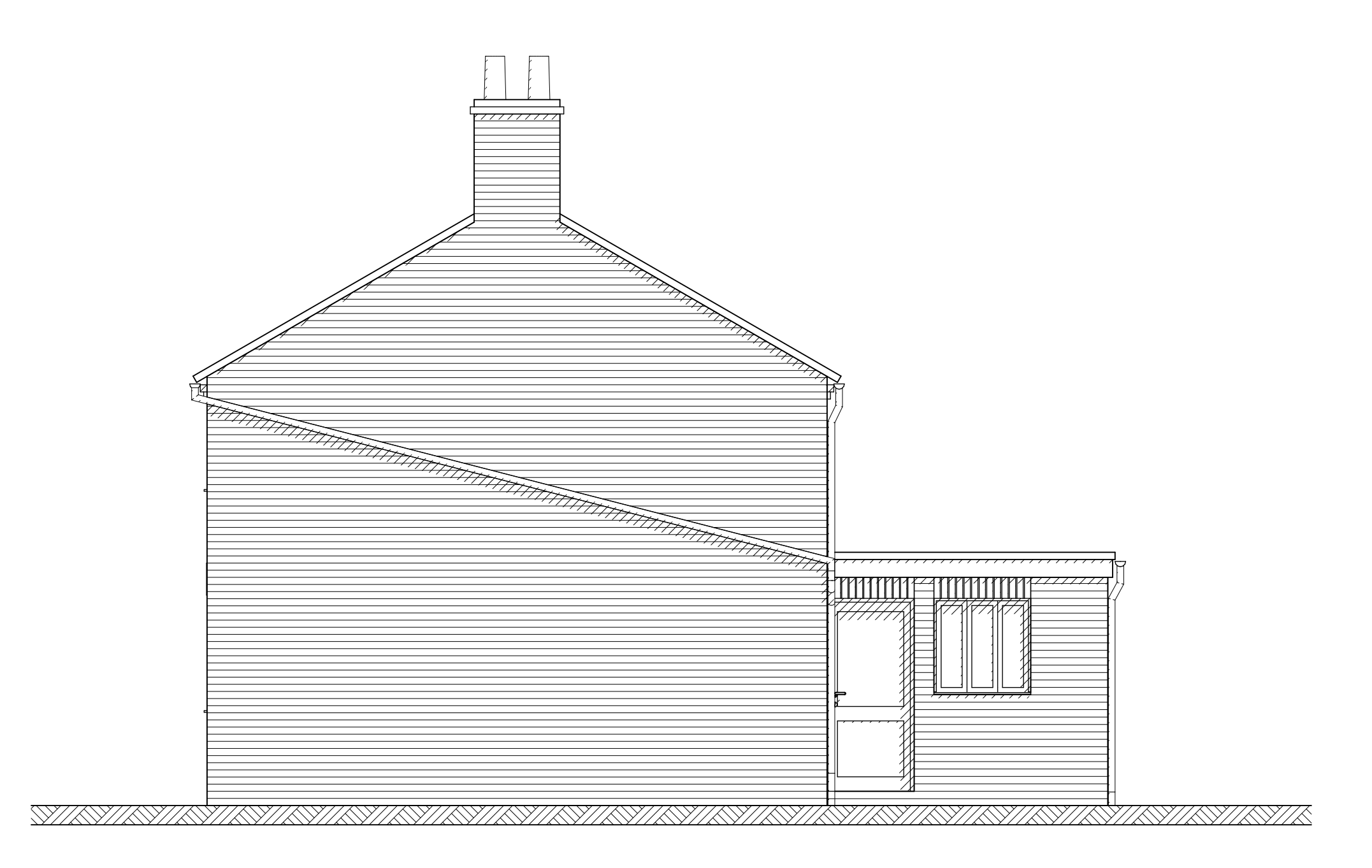
North elevation existing