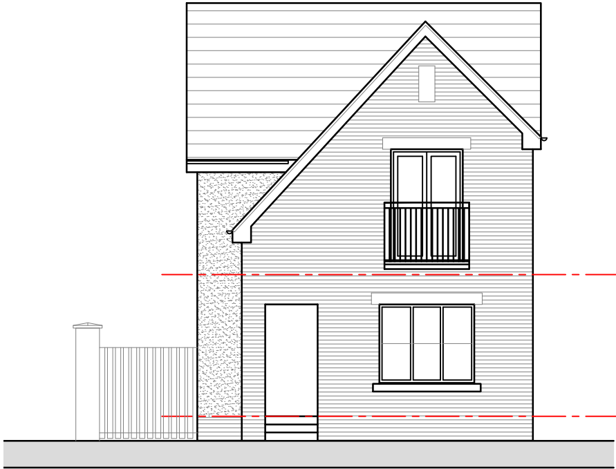
Front Elevation As Existing