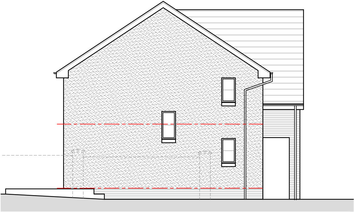
Gable Elevation As Existing