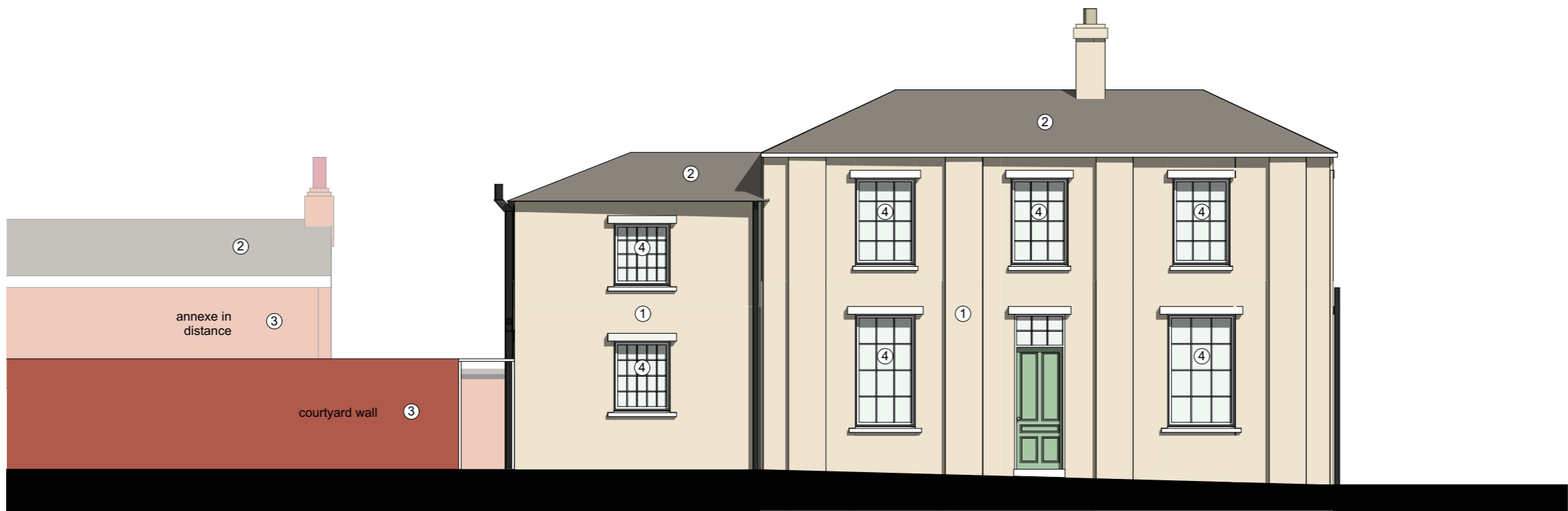
1 E-03 West Elevation 1:100