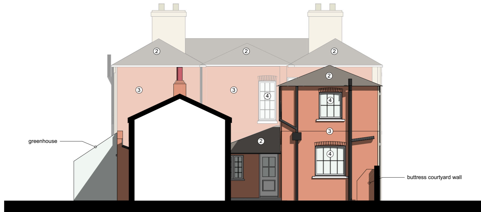
2 E-04 North Elevation 1:100