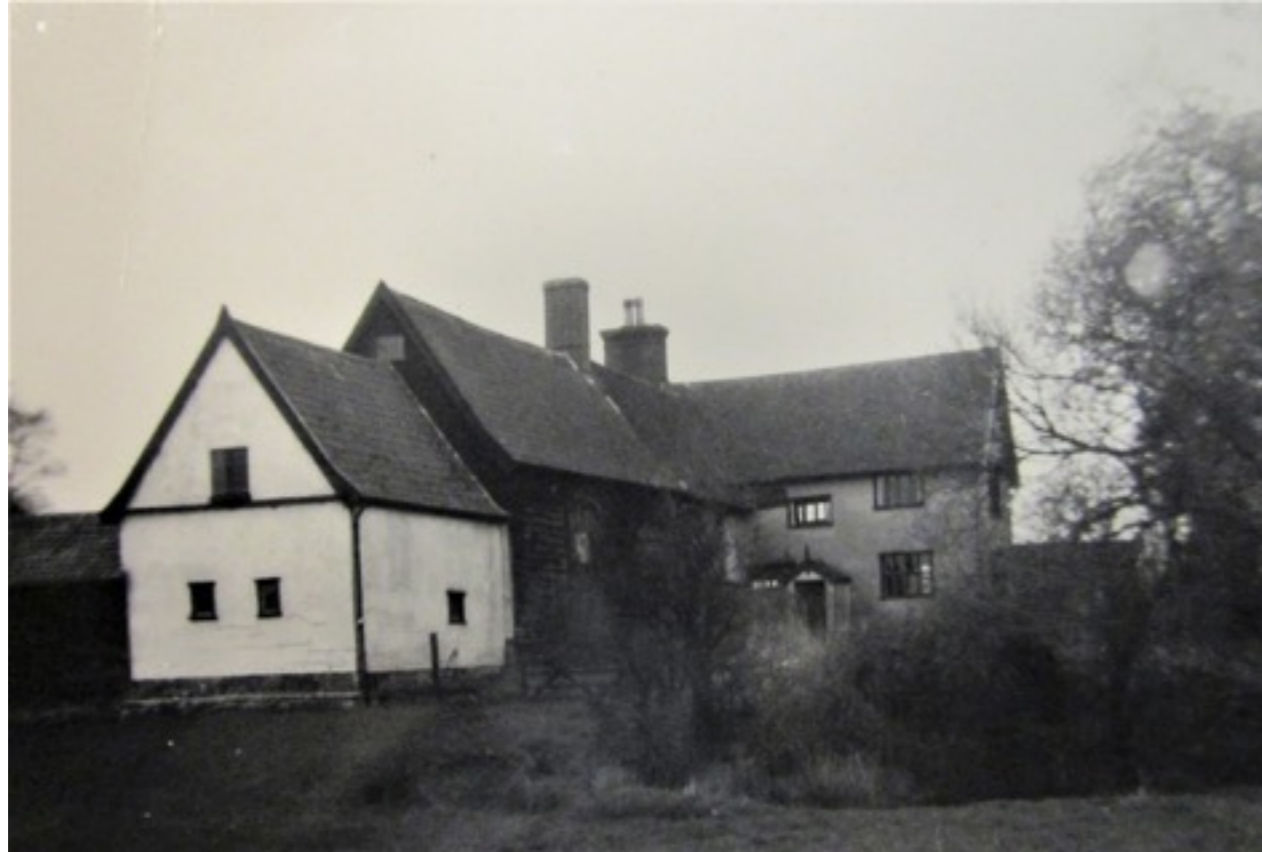
Undated, mid-twentieth century photograph, showing the barn originally clad in weatherboard and the lower range to the east rendered, possibly over weatherboard