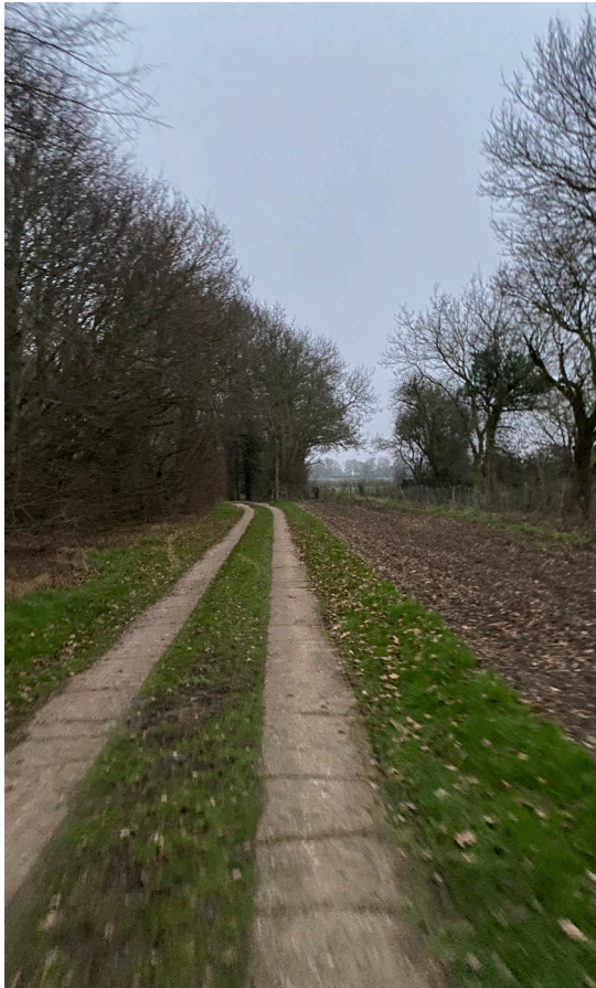
Driveway off Top Road