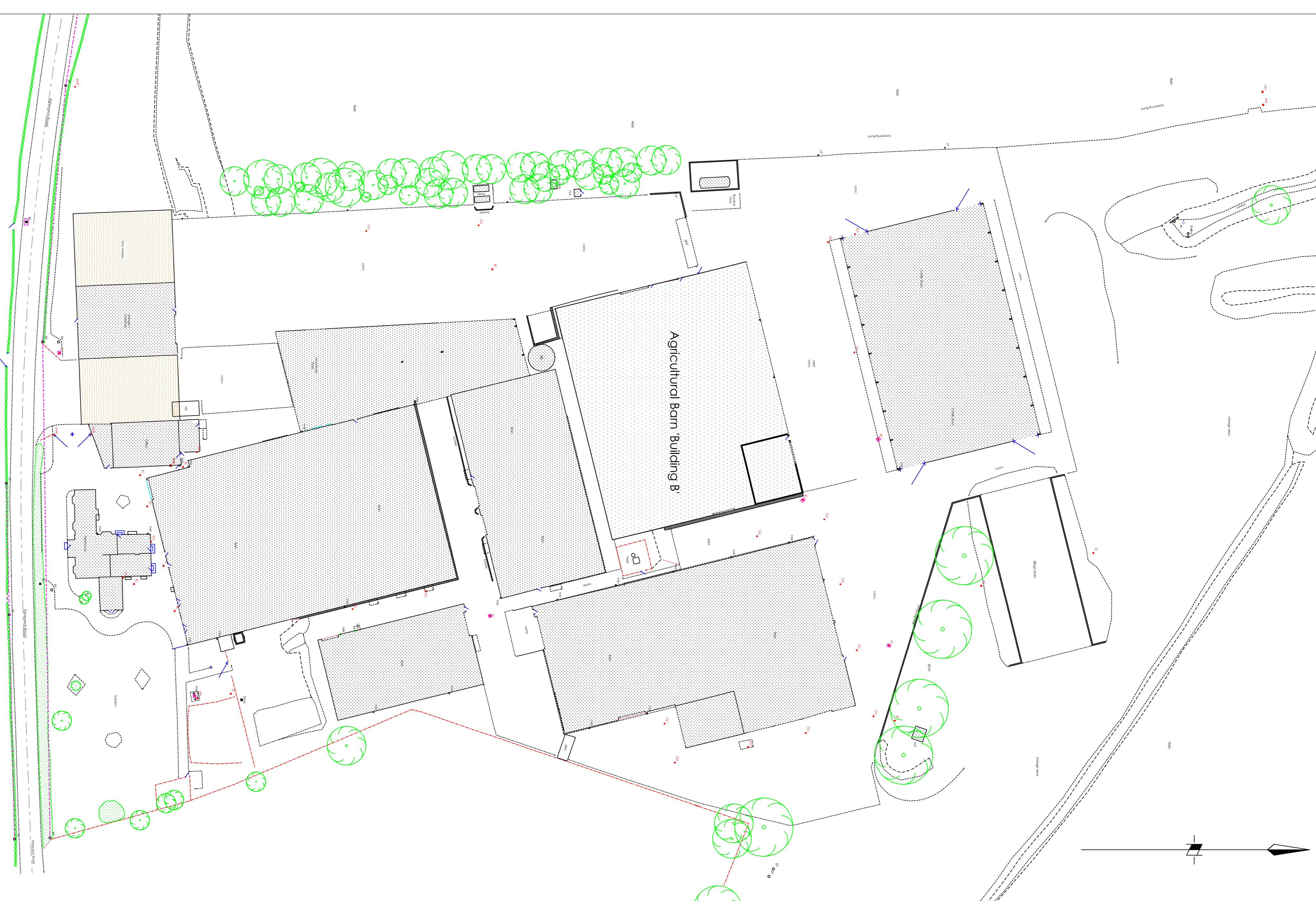
Building B - Site Layout Plan Scale 1:500